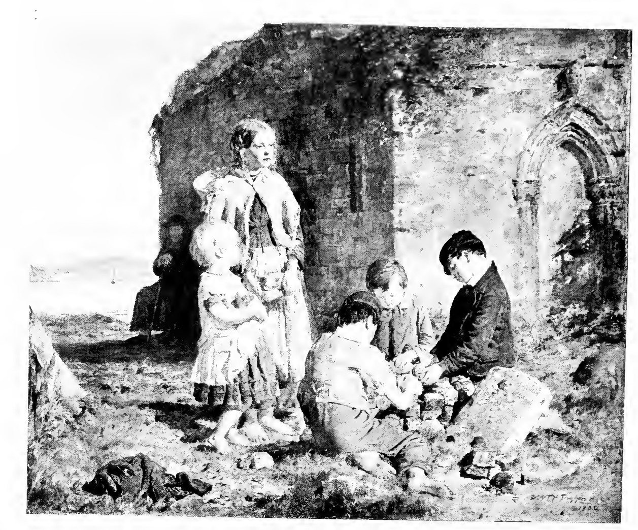
THE PAST AND THE PRESENT