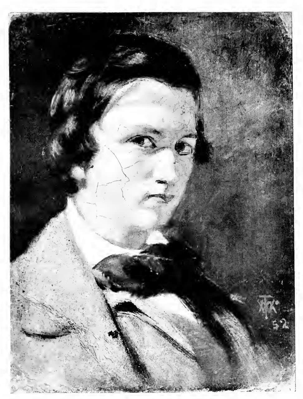
SELF-PORTRAIT At the Age of Seventeen