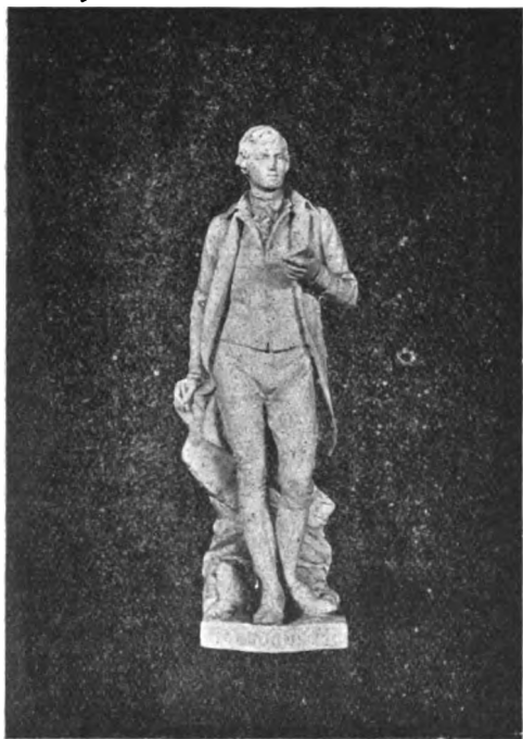
From Photo by

In the Spring of 1787 he had been contemplating, as he expressed it to Dr Moore, "a few pilgrimages over some of the classic ground of Caledonia—Cowdenknowes, Banks of Yarrow,