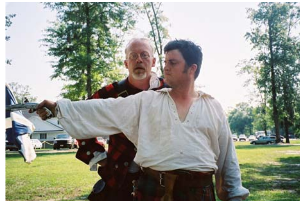
"I've got your back."