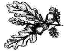
Clan Plant Badge