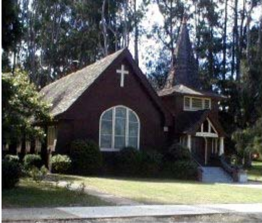
† The Chapel at Mare Island †