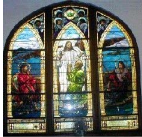
† Tiffany Windows above altar †