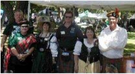
The Morning Crew