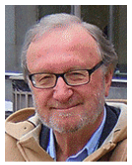
Tweets about "#genealogy"