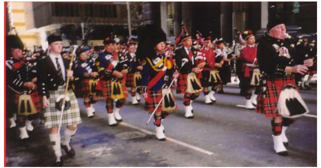
The Massed Pipe Bands

Adults:- $10-00. Conc:- $8-00. Children 5 to 16 years $5-00