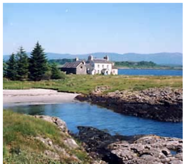
The Old Ferry House at Grass Point.