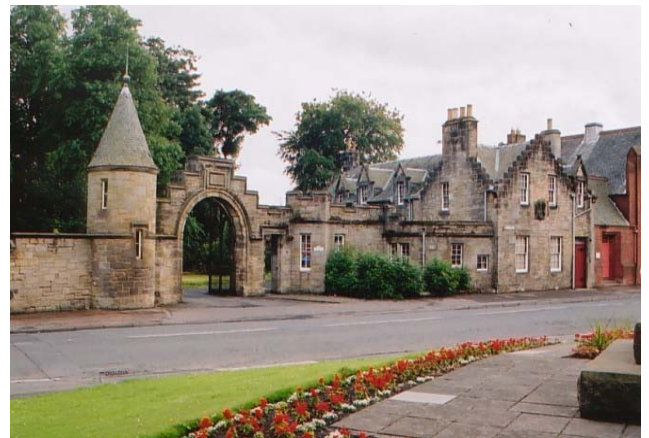
Entrance Gates to Leslie House Fife.

The Category "A" listed building is set in 26 acres of grounds and is recognized as one of the most important designed landscapes in Scotland.