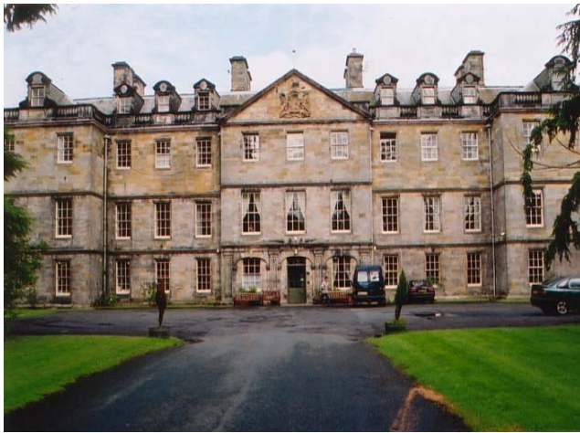
Leslie House, Fife, Scotland.

2005, restoration of the A-listed Leslie House and its conversion to 17 flats is to be underpinned by a development of 17 houses in the western woodlands . Already severely eroded by the expansion on Glenrothes, the Inventory entry highlighted the need for a complete historic assessment of the estate, particularly the core 17 th and 18 th century terraces and parterres. Although these are now to be restored as part of the overall project, we are concerned that more research is needed in this area and more details of proposals are needed from the developer before any such work is undertaken.”