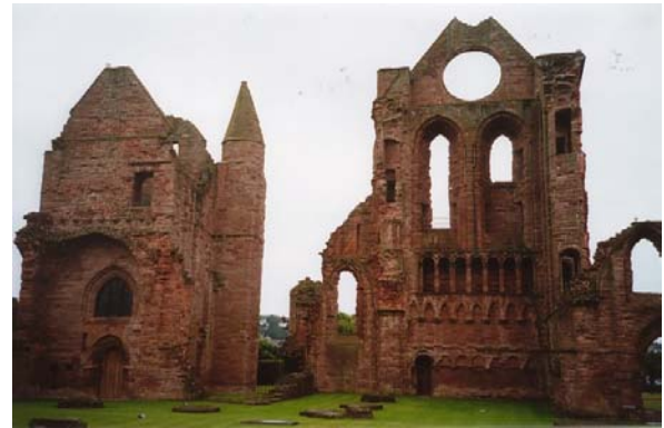
Arbroath Abbey where the 1320 Declaration was signed

He was in the Fleet Air Arm, but was invalided out after an accident. He migrated to New Zealand and after service in World War 11 he settled in Rotorua and died there in 1989, leaving no male heir, and thus this ancient branch of the Leslie family came to an end.