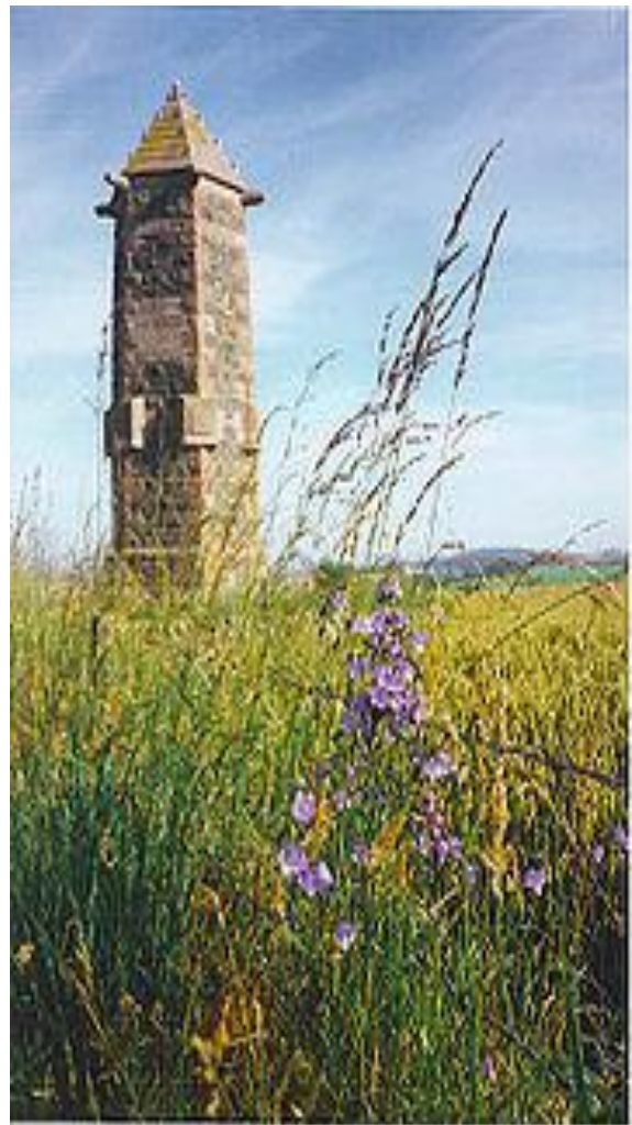
The Monument to the Battle of Harlaw.