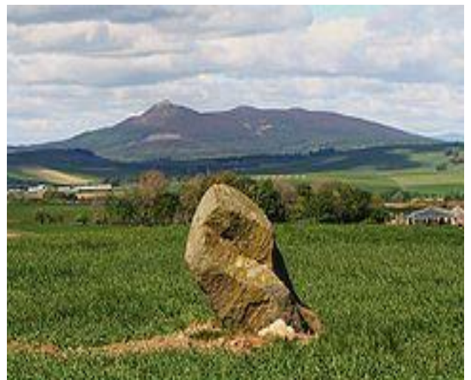
Bennachie from Harlaw field