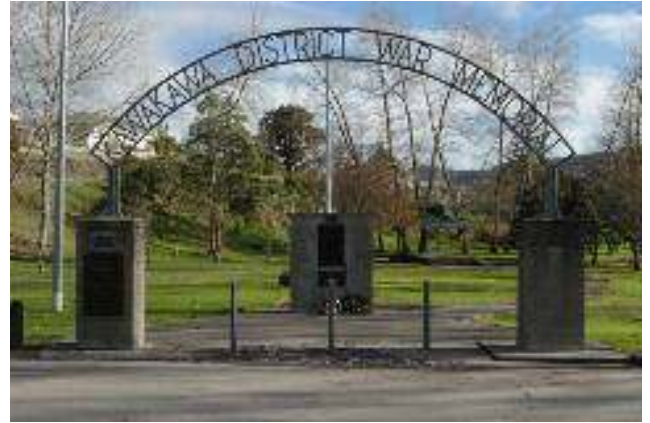
Gates to the Kawakawa District War Memorial In Memory of those from the district who fell in the Great War 1914 – 1918.

In the Prowse Point Military Cemetery are:-