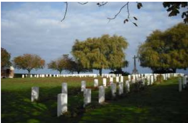
Prowse Point Military Cemetery, Hainaut, Belgium

He was serving with the New Zealand Rifle Brigade, 2 nd Battalion at Ypres, Belgium, when he was killed in action on the 12 th August 1917 and is buried at the Prowse Point Military Cemetery, Commines-Warneton, Hainaut, Belgium. Grave Reference:- IV.A.2.