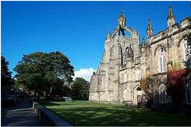
Kings College, University of Aberdeen with the Crown Tower on the Chapel.