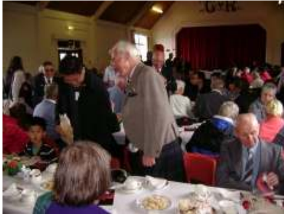
Some of the guests enjoying lunch