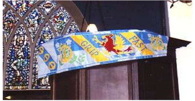
Close up of the Earl of Rothes Standard

I would like to thank my friends from Scotland, England, Canada, USA, Australia and New Zealand who have sent me these photographs. I have named the people in the photographs that I know and unfortunately there are others who I cannot name, but I think that it is important to get the photographs out.