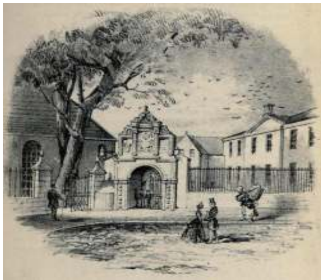
The 1 st Trades Hall which was called Trinity Hall after the old Convent. 12 th Century to 1847

The Seven Incorporated Trades of Aberdeen are a very important part of Aberdeen history, which comprise seven trades, Hammermen (1519) (Goldsmiths etc) Bakers (1398) Wrights & Coopers (1527) Tailors (1511) Shoemakers (1484) Weavers (before 1222) and Fleshers (1534)