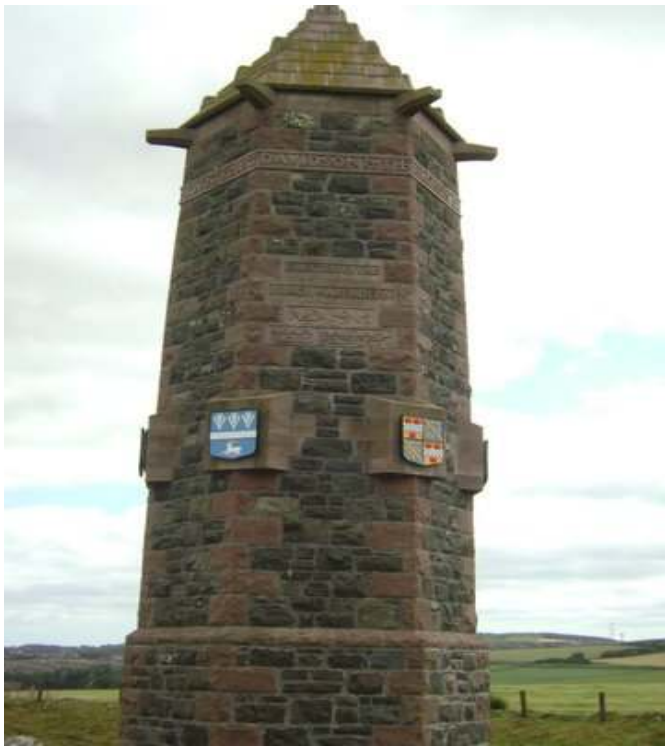
The Battle of Harlaw Memorial