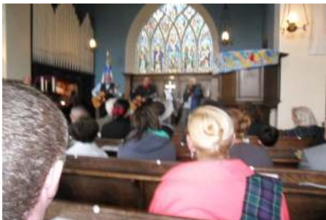
The Service in the Chapel of the Garioch with the Standard of the Earl of Rothes on the right.