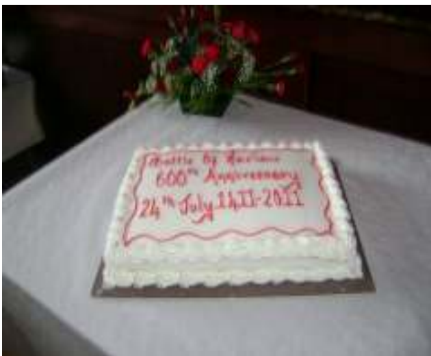
Another cake of the Commemoration