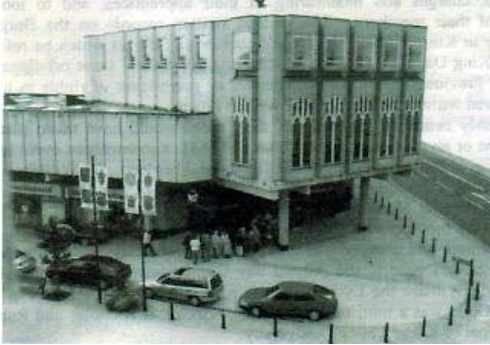
Trinity Hall, Holburn Street Aberdeen

highest standards and was opened in 1633, as the Trinity Hall. In 1847, with the coming of the railway, large scale development was required and it was decided to build the 2 nd Trades Hall at the end of the new Union Street. The hospital had ceased to exist around the end of the eighteenth century and the Trades Hall continued in use until 1966, when it was decided to move to a less congested site.