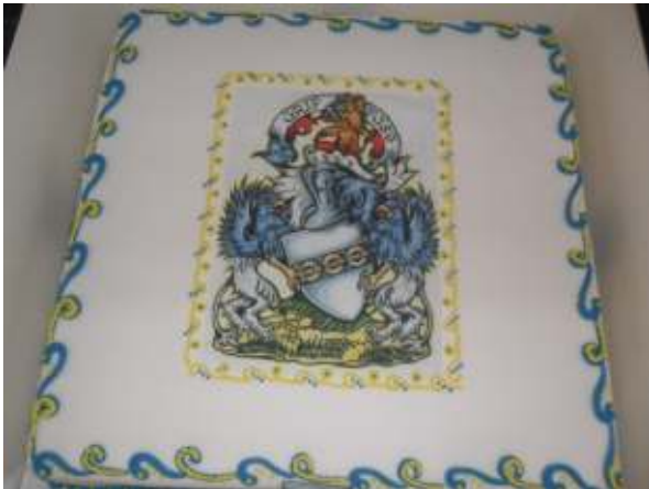
The magnificent cake with the Balquhain Arms