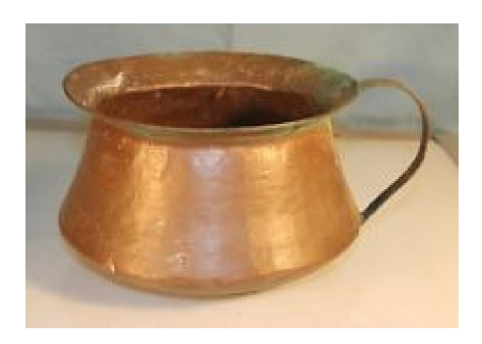
A copper chamber pot or "tinkle"

This invention was known as the Bourdaloue and soon became popular in England as a Carriage pot, hanging from the back of the travelling coach and ladies who were caught short, would call for a loo stop and being unable to clamber fences, take to the scrub in the mud with their voluminous skirts with acres of petticoats. Would congregate around the rear of the coach and use the carriage pot, or loo, a word still in common use. Some of these contrivances came to New Zealand, a few ceramic, but most as cheap tin or leather and so did not last long. What is strange about the Bourdaloue is that ladies always used it while standing up, something that I will elaborate on, except to say that female astronauts and Antarctic field workers, still use a similar device, as their suits only have a zip the same as the males, being used in both cases while standing up. Lets face practicality, we couldn't send a giant C17 Globemaster down to the Antarctic to rescue someone with a frostbitten bottom. With tin or other metal chamberpots in continuous use, in early New Zealand, another word evolved due to the musical qualities while being used and that word is "tinkle".