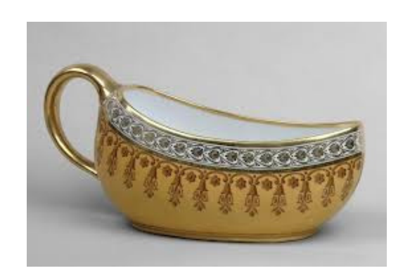
A yellow ceramic Bourdaloue

In the earliest ships there were no cabins, people were allotted spaces in the hold, under the deck, with blankets hung on ropes, giving them privacy with no hot or cold running water and every family had a bucket for a toilet. Ships toilets were always in the bow of the ship and were wooden seats above a hole in the side of the ship, the front always used as ships always sailed with the wind from the stern (behind) and it was soon learnt that anything thrown from the back of the ship was received back in the face and so every morning the males trudged to the front of the ship, to empty the buckets. In a later article I will mention how both my great grandmothers came to the district by boat. Great Grandmother Ann Leslie by cutter to Mangawai and 8 months pregnant, Grace Watson to Port Albert, both journeys taking a couple of days in ships that had no toilets at all, so how did they cope?. Males had no problem in going to the bow when the need arose. Every family of course had a chamber pot, but the ladies also had a more refined version. A narrow one with a lid that was invented in the 1700s for ladies to use in church during long 2 to 3 hour sermons.