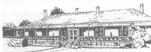
Newstead Cottage 1846