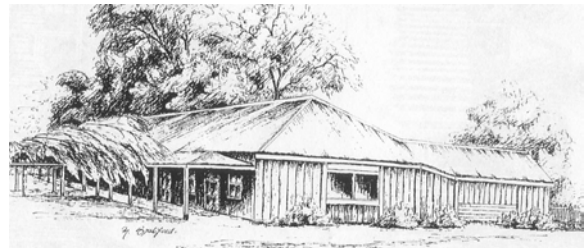
Canning Downs homestead 1842