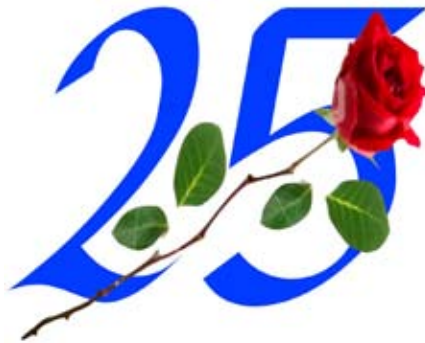
A Milestone Burns Nicht

Tickets must be purchased by Saturday, January 19, $60 for all - $70 for Patrons and $100 for Benefactors. There is a $10 discount for seniors over 65. Send ticket requests to Burns' Nicht, c/o Memphis Scottish Society, P.O. Box 241934, Memphis, TN 38124-1934, or call 901-757-4200 for more information.