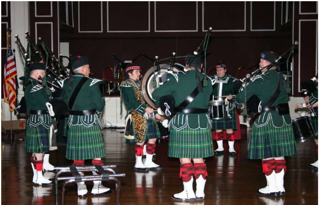
WOLF RIVER PIPES AND DRUMS AND THE SCOTTISH COUNTRY DANCERS.