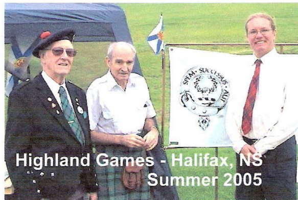
Highland Games - Halifax, NS Summer 2005