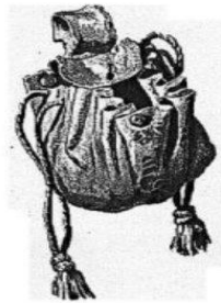
Early (Rob Roy)

Most modern sporran chains are threaded (together with the belt) through a pair of loops at the back of the kilt.