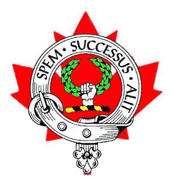
An Cirean Ceann Cinnidh