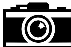
photo storage boxes, and send in your best photos. With your help, this will be the best presentation yet!

Start digging through those photo albums and