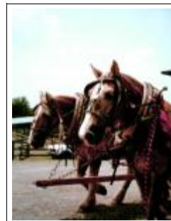
Tom & Bud

Please return your registration form before July 23 . We'll have to turn in a firm headcount for the buffet. Crenshaw's will prepare food for one or two more than we request, but if you plan to attend, please don't assume that