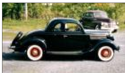
1935 Ford coupe