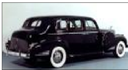
1938 Cadillac Limousine

dan, and after that, a new 1949 2-door Hudson. Then I showed up, along with a '31 Model A, a 1941 Ford 2-door sedan, and a 1950 Olds. Then there was a huge 1952 Studebaker 4-door Land Cruiser that my Mom couldn't drive, so it was soon replaced with a '49 Pontiac convertible, that was followed by a 1947 Mercury convertible and two Oldsmobiles (a 1951 "98", and a 1949 coupe).