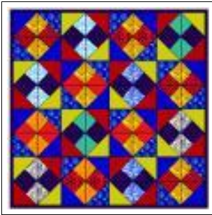
'Our Family Quilt' 2006