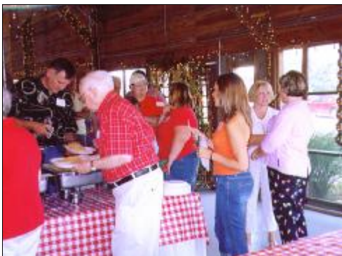
Catfish and all the trimmings!