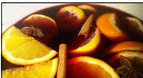
A seasonal favorite — mulled wine