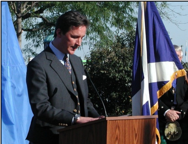
His Grace Torquil Campbell, 13th Duke of Argyll

All in all, this monument is something in which all Scottish America can be proud!