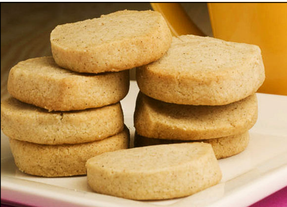
Delicious and melts in your mouth: burrebrede

A Blythe Yule an' a Guid Hogmanay tae ye an' yer kin!