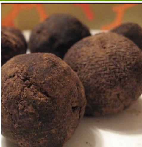
Chocolaty goodness — shortbread truffles

In a double boiler, combine the chocolate and butter together and melt together, then stir in the shortbread crumbs and whisky and combine thoroughly. Transfer mixture to a shallow bowl and leave to