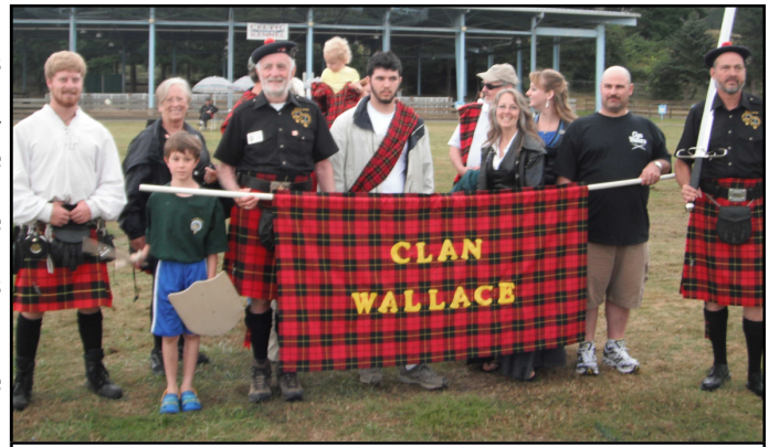
Waiting for the parade to begin at Enumclaw

This is a unique festival in this area because it is sponsored by the Presbyterian Church rather than a Scottish Society. This year a high school in the area named a Scottie Dog as their mascot. Finding a kilt for this one was a challenge, I bet.