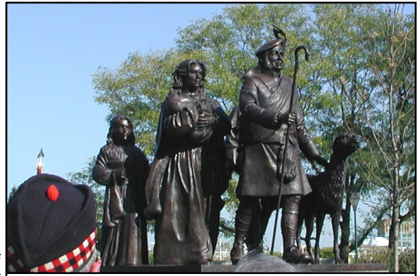
The completed monument has exceeded all expectations.

The four figures and a dog on the monument are somewhat larger than life-size and stand on a granite base four feet high, 6 feet long and 6 feet deep. There are two bas-relief plaques on the base depicting the contributions that Scots have made to Philadelphia