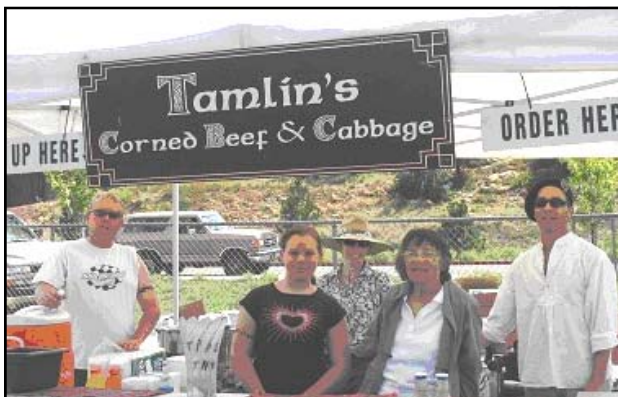
Tamlin's Fine Corned Beef & Cabbage has been a mainstay of the Flagstaff (AZ) Scottish Games for many, many years.