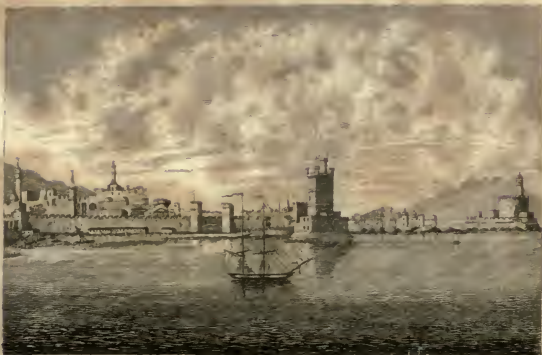
Drawn & Eng d by W m Arcland