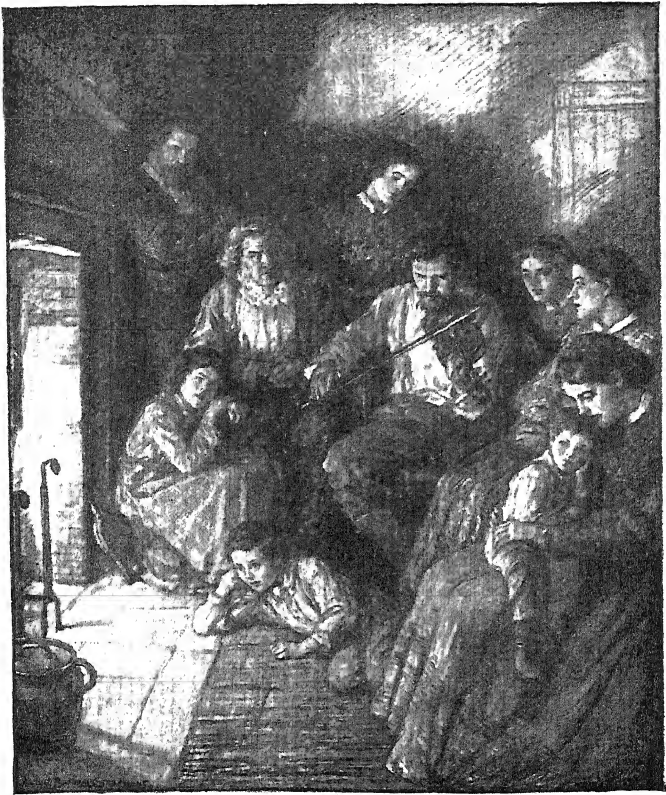
As he played I was a boy again, lying before the fire. P. 452