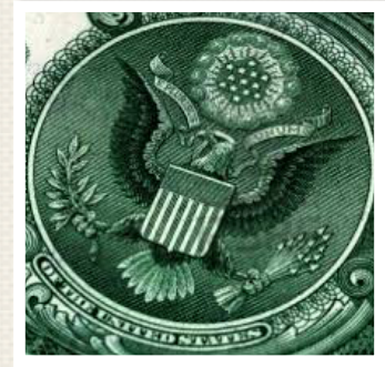
THE US GREAT SEAL DESIGN BY SCOTTISH RITE MASONS, PRESIDENT FRANKLIN D. ROOSEVELT AND HENRY A. WALLACE, WHO SOLD OUT THE AMERICAN PEOPLE TO THE FED BANKS BACK IN 1934.

The creation of both the Presidential and the United States great seals evolved directly from the symbolism of the exiled Scottish Sovereigns. The evolution of the right to rule that predates the 1745 Up-Rising in Great Britain with the founding of the United States.