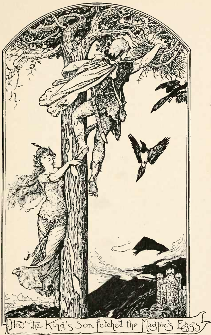
How the King's Son fetched the Magpie's Eggs