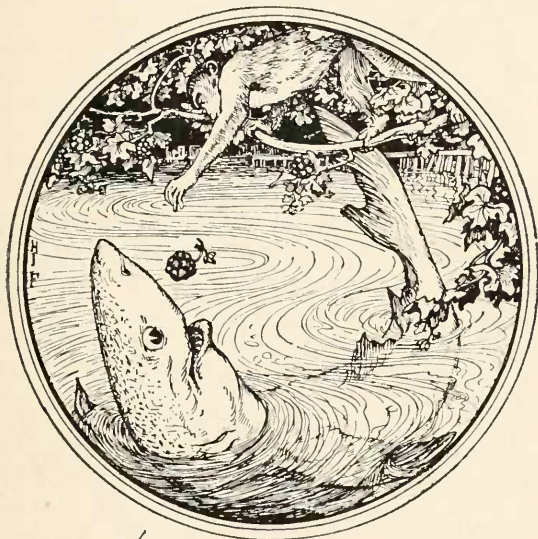
The Monkey feeds the SHARK

‘Well, I don’t like salt myself,’ said the monkey; ‘so if you will open your mouth I will throw this beautiful juicy kuyu into it,’ and, as he spoke, he pulled one off the branch just over his head. But it was not so easy to hit the shark’s mouth as he supposed, even when the creature had turned on his back, and the first kuyu only struck one of his teeth and rolled into the water.