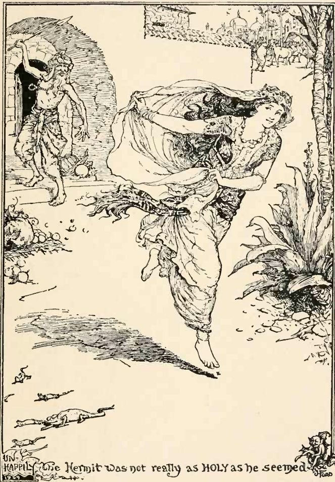
UN- HAPPILY The Hermit was not really as HOLY as he seemed.