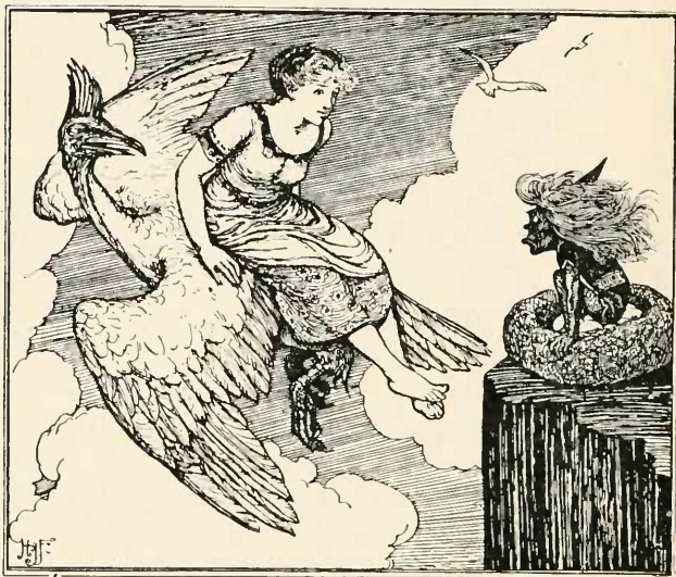
HOW BELLAH FOUND KORANDON

'I am sitting on six eggs of stone, and I shall not be set free till they are hatched.'