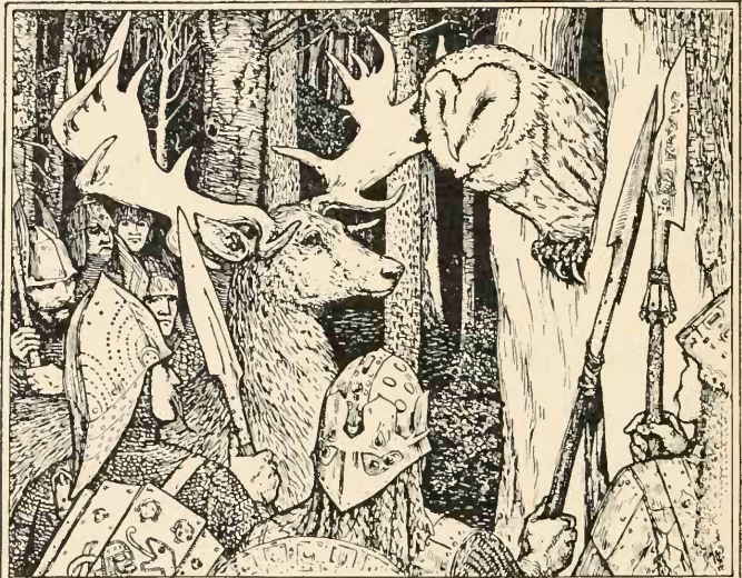
The Stag - of Redyvre brings the Seven Companions to the Owl of Cwm Cawlwyd.

not withered stumps? Yet until to-day I have never heard of the man you name. Still, I will guide you to the oldest animal in the world, and the one that has travelled most, the eagle of Gwern Abbey.' And he flew before them, as fast as his old wings would carry him, till he reached the eagle of Gwern Abbey, but when they inquired of the eagle whether he knew aught of Mabon he shook his head.