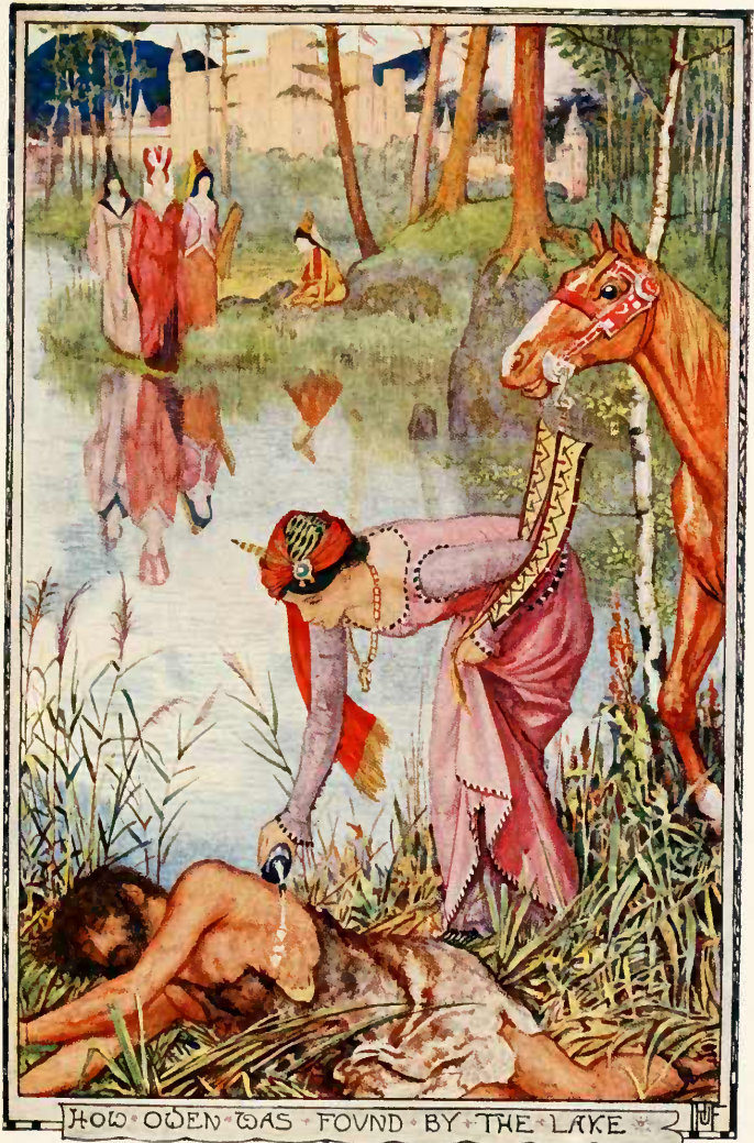
HOW ODEN WAS FOUND BY THE LAKE