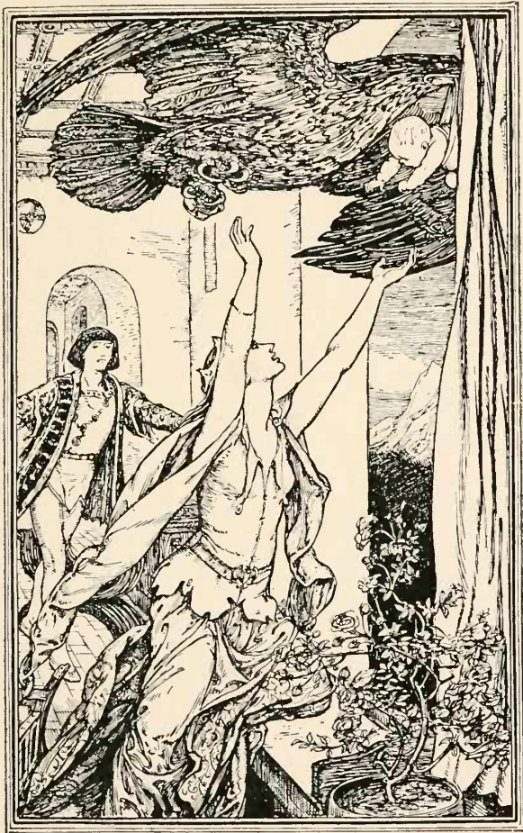
The Princess loses her first Baby .