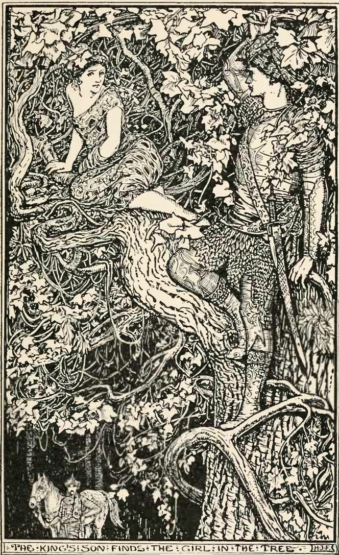
THE KING'S SON FINDS THE GIRL IN THE TREE - JAMES