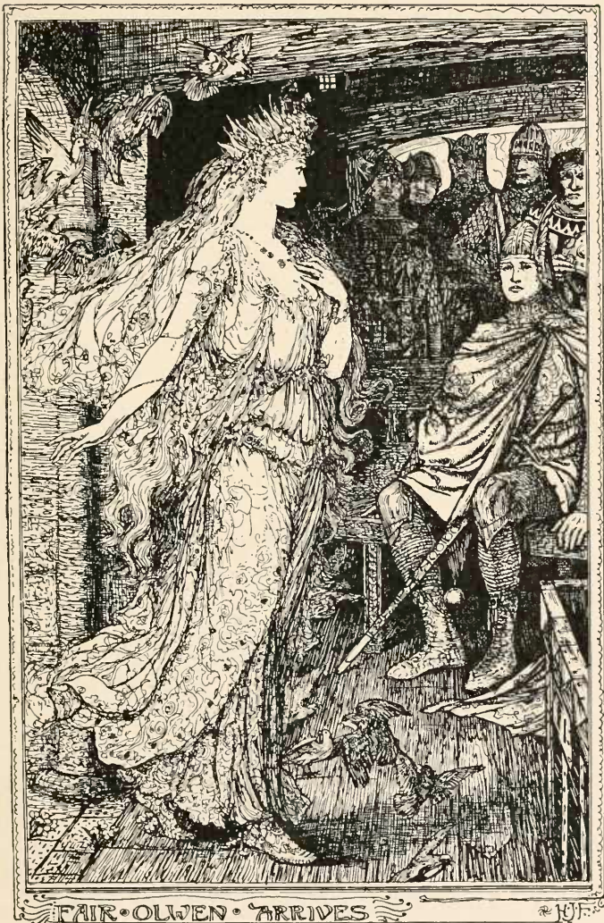
FAIR • OLWEN • ARRIVES