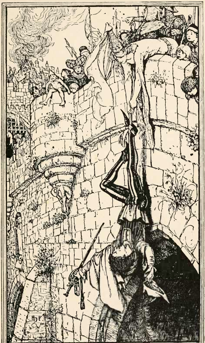
HOW THE SHIFTY LAD WAS HUNG ON DUBLIN BRIDGE