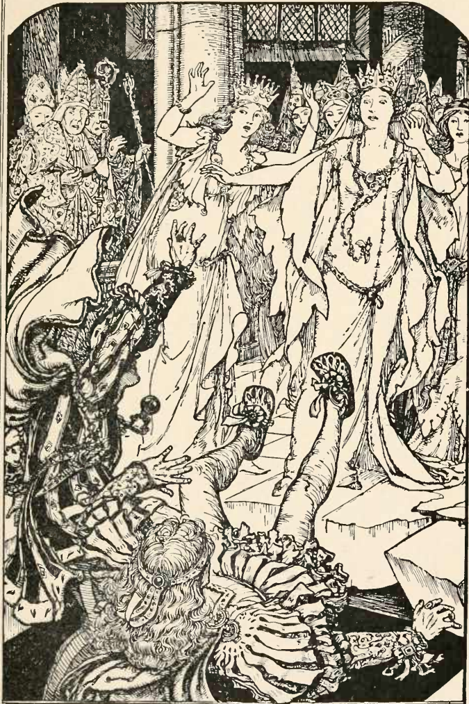
DOWN WENT THE TWO BRIDGROOMS