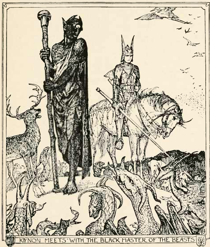
KYNON MEETS WITH THE BLACK MASTER OF THE BEASTS

him graze a thousand beasts, all of different kinds, for he is the guardian of that wood, and it is he who will tell thee which way to go in order to find the adventure thou art in quest of."