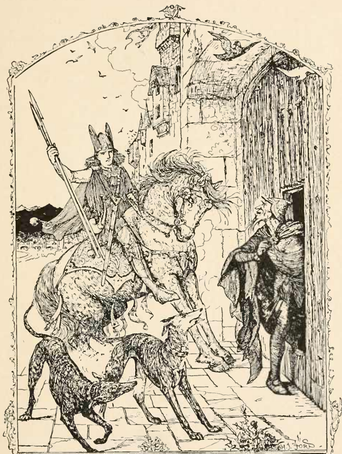
Kildch arrives at the Gate of Arthur's Palace