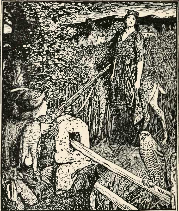
INSTEAD OF A DEER A WOMAN WITH LONG BLACK HAIR WAS STANDING, THERE

'Ah, you have a gun,' said the farmer as the young