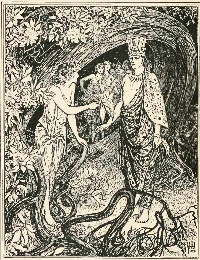
HOW THE IRON TREE BOWED DOWN AND THE GIRL GAVE OF ITS LEAVES AND FLOWERS TO THE KING.

signed to one of his attendants, who followed the path that the boy had taken to the hut.