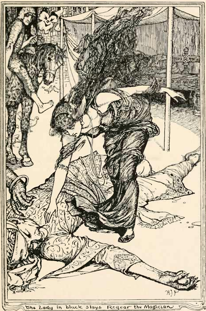
The Lady in black slays Regear the Magician