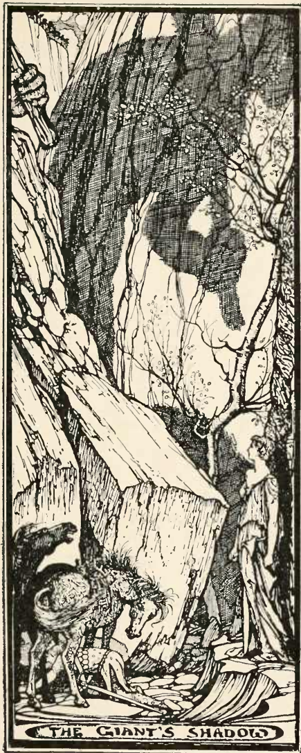
THE GIANT'S SHADOW