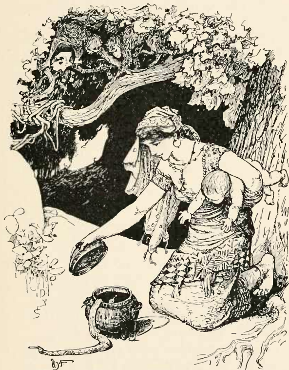
The One-handed Girl befriends a snake

'We cannot kill her,' answered they; 'if we did, our son would assuredly kill us. Let us do as the others did,