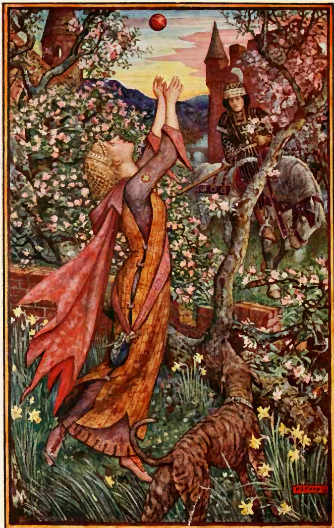
Digitized by Microsoft® “How the King found the girl playing at ball in the orchard.”