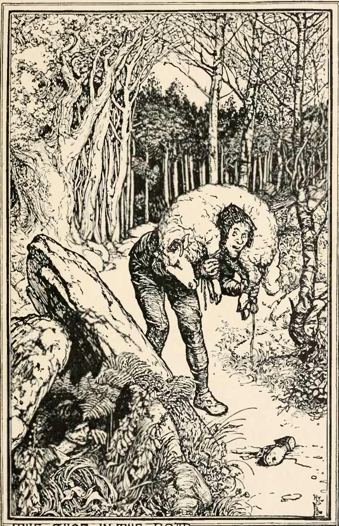
THE SHOE IN THE ROAD