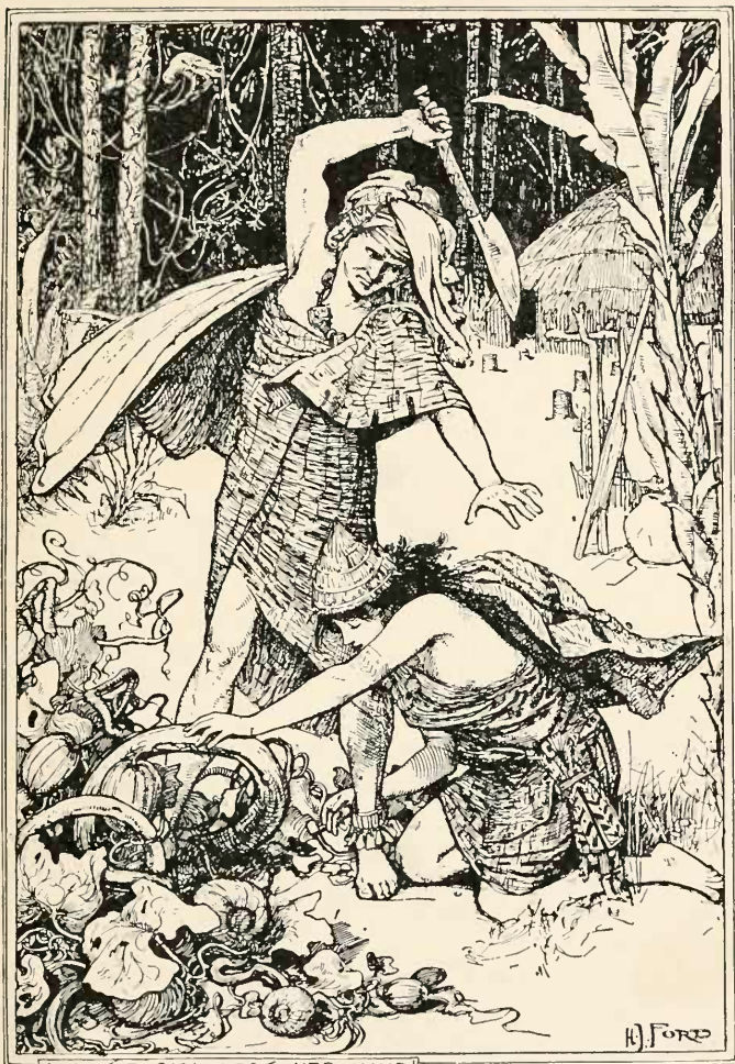
HOW THE GIRL LOST HER HAND.