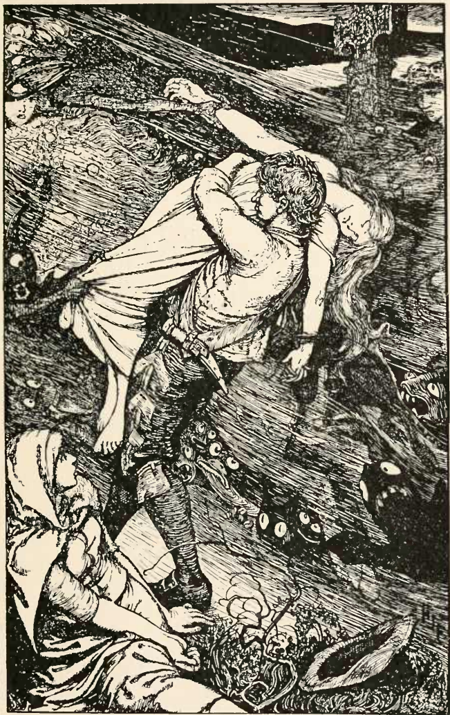
HOW JOHN GOT HIS WIFE BACK FROM THE FAIRIES