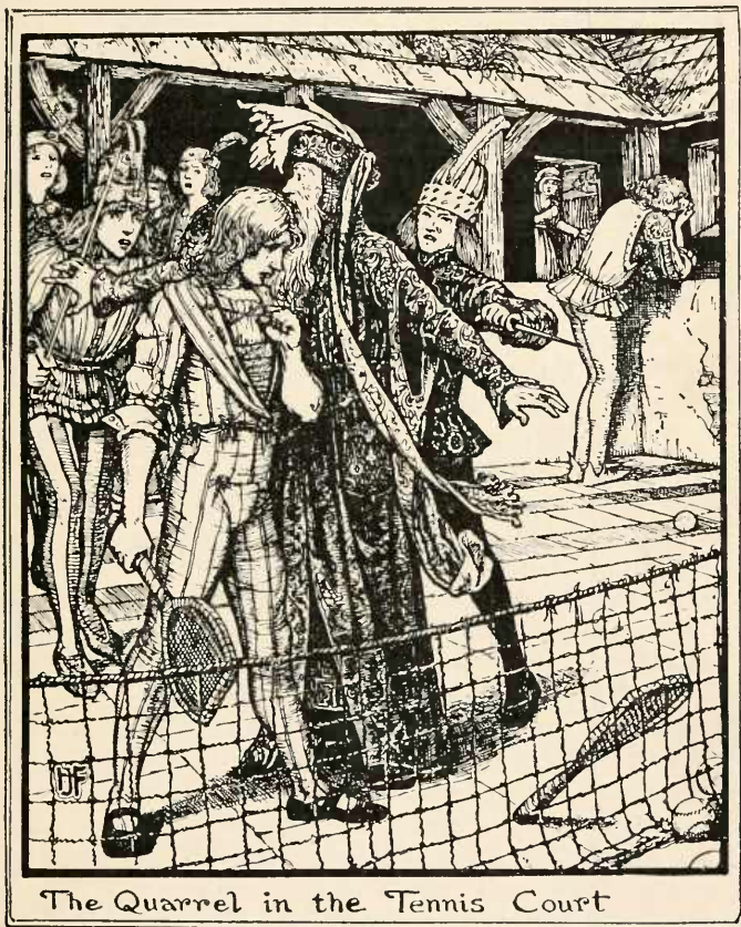
The Quarrel in the Tennis Court

stood for a few minutes with his back to the room, where the company of young men remained silent. Then he came back, his face white and stern.