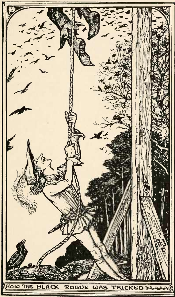
HOW THE BLACK ROGUE WAS TRICKED