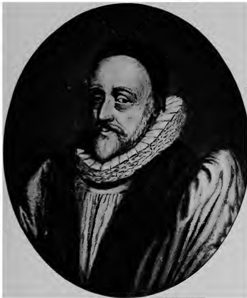
JOHN SPOTTISWOODE Archbishop of St. Andrews