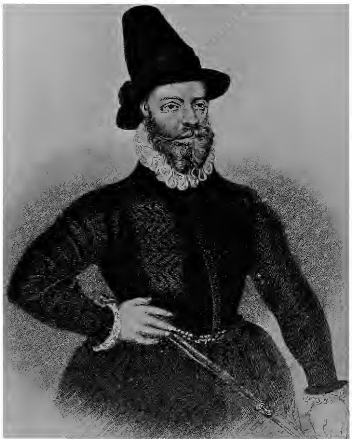
JAMES DOUGLAS Fourth Earl of Morton