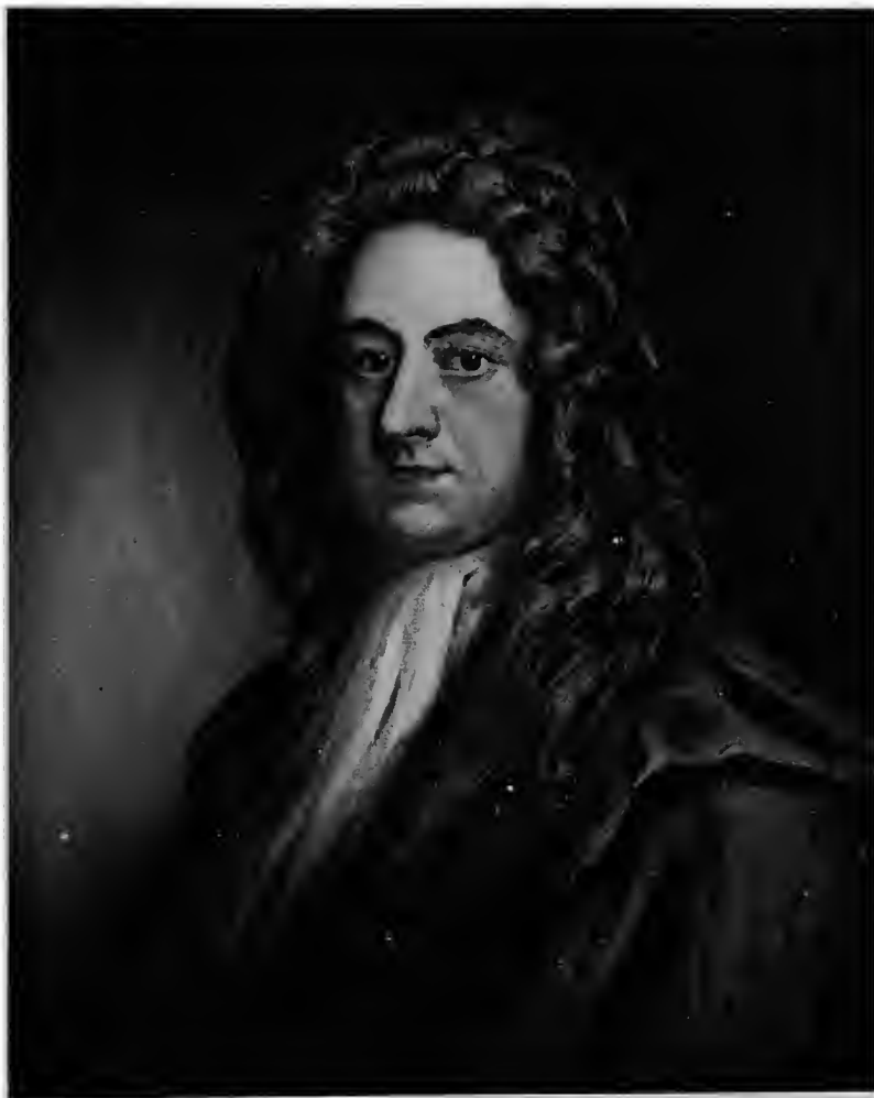
GEORGE GORDON First Earl of Aberdeen