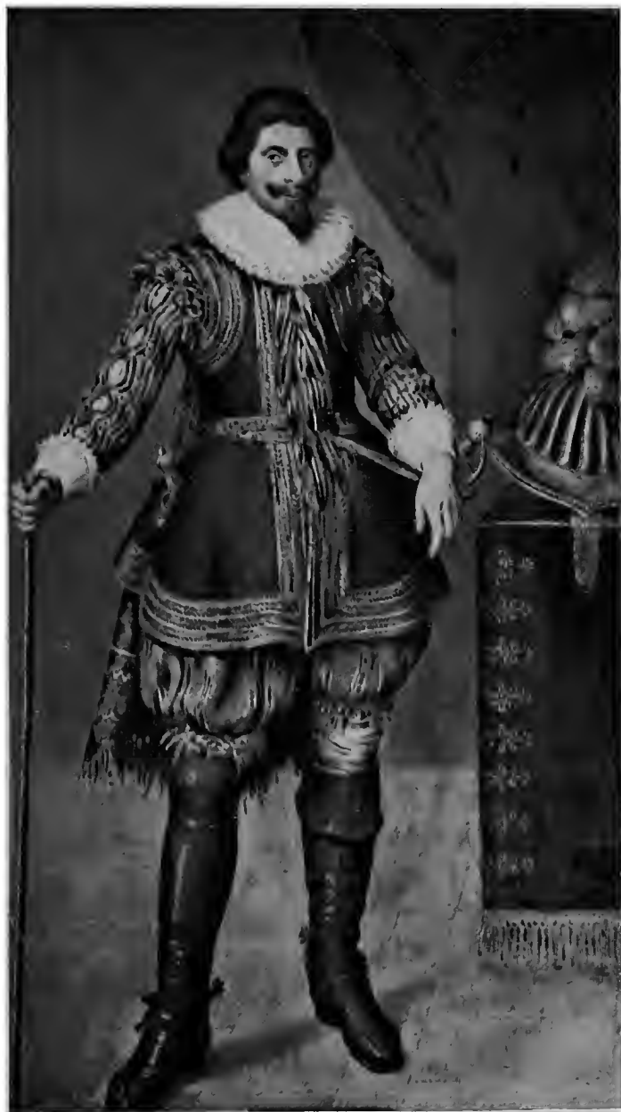
COLIN CAMPBELL Sixth Earl of Argyll