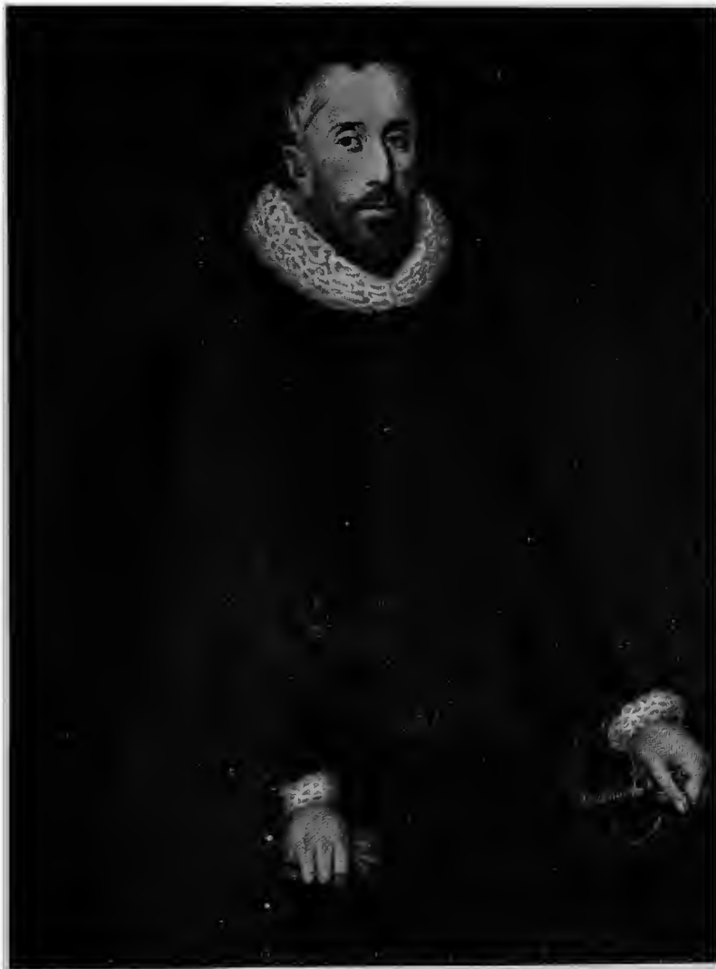
ALEXANDER SETON Bisop of Dunfermline