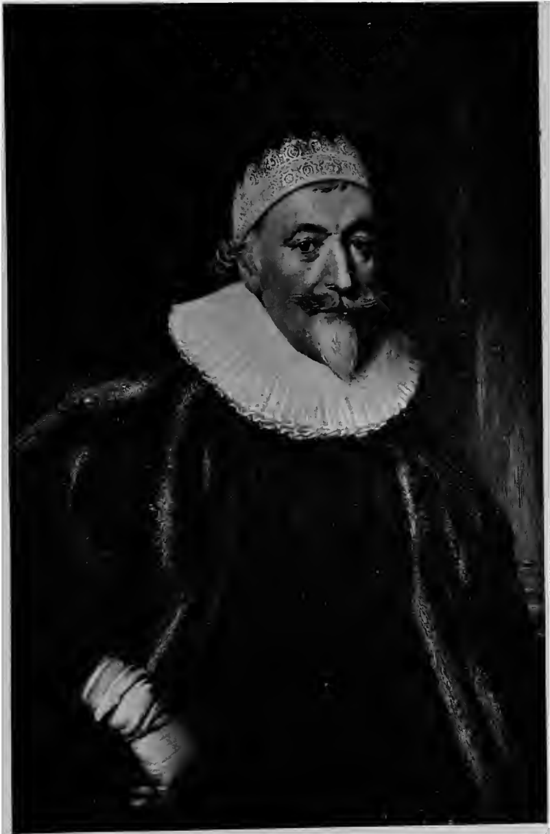
GEORGE HAY First Earl of Kinnoull