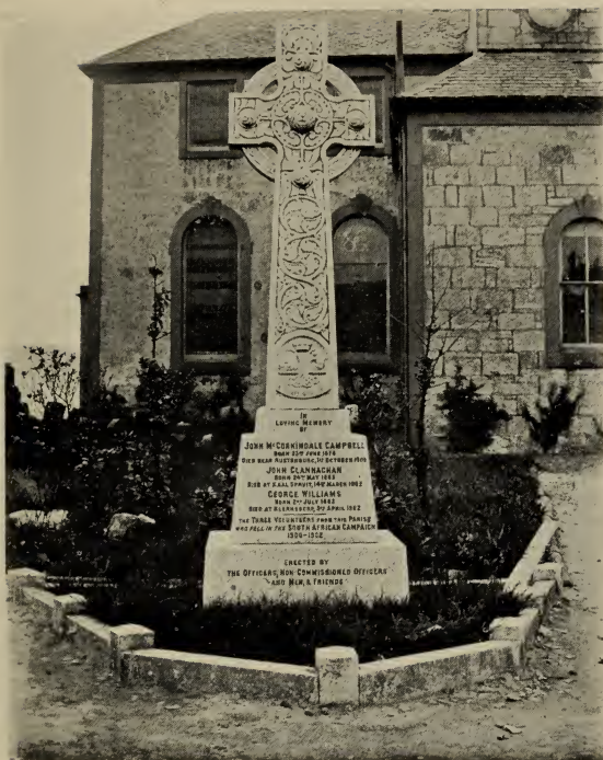
SOUTH AFRICAN VOLUNTEERS' MEMORIAL.