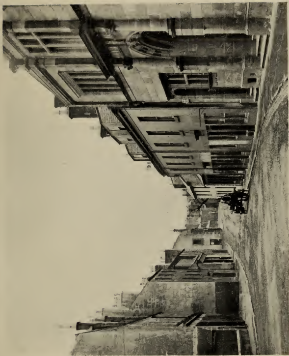
GLEN HALLS AND PART OF MAIN STREET, NEILSTON.