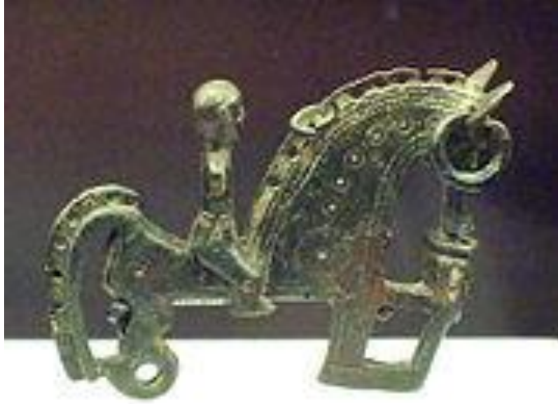
A metal figurine of the Celtiberian metal smiths of that time, circa 3-to-5 B.C., Spain. 1