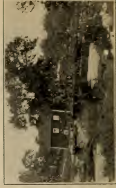
THE MILL ERECTED IN 1800