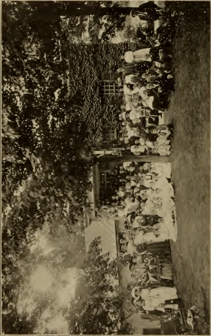
KINSMEN AT THE REUNION IN 1910