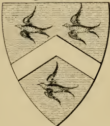
BYRES OF TONLEY