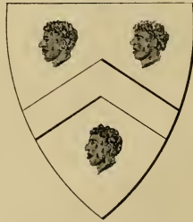
MOIR OF STONEYWOOD