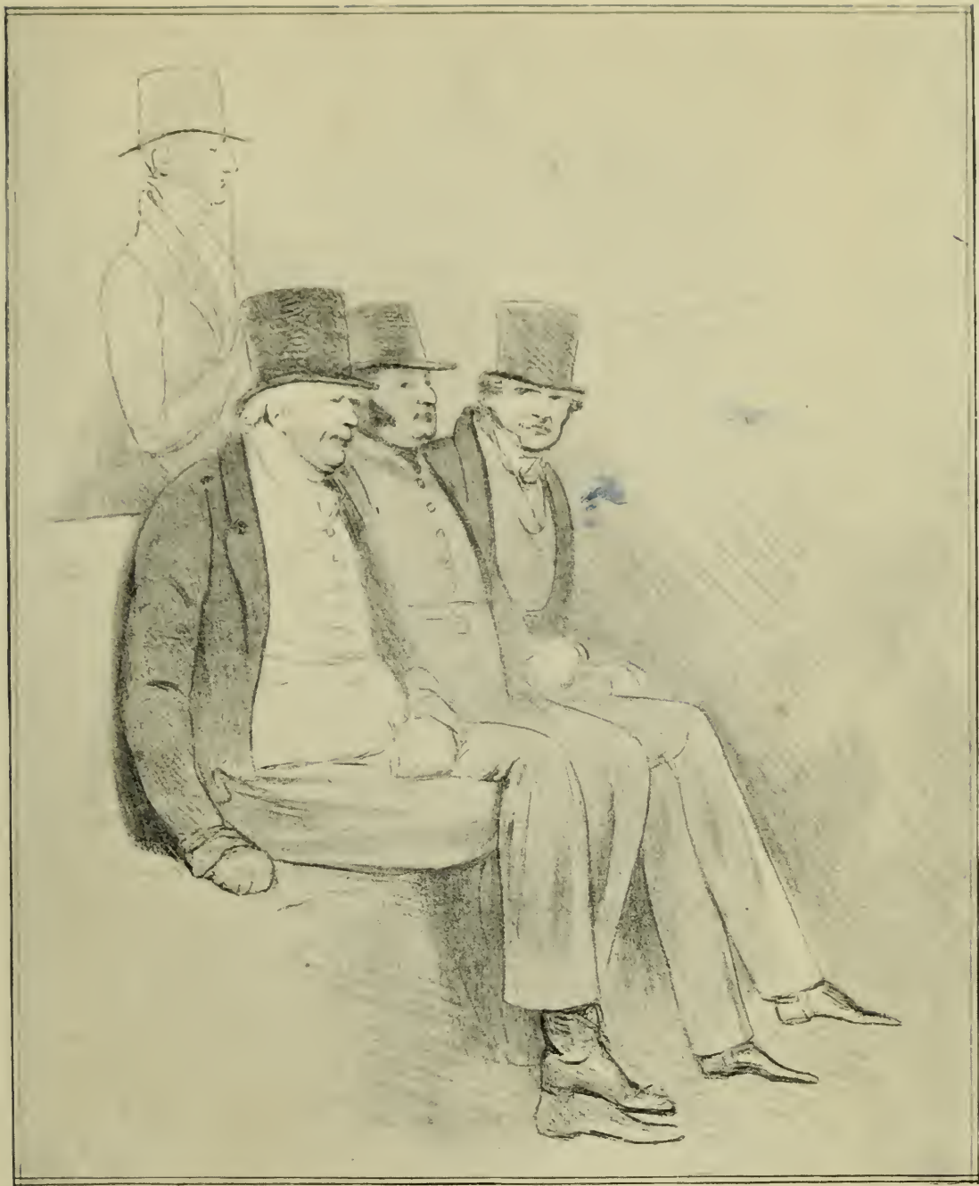
Sir F. BURDETT COBBETT ALTHORP STANLEY (standing)

On the first day of the Reformed Parliament, 1833, Cobbett seated himself on the ministerial bench, to the surprise of some of its occupants.