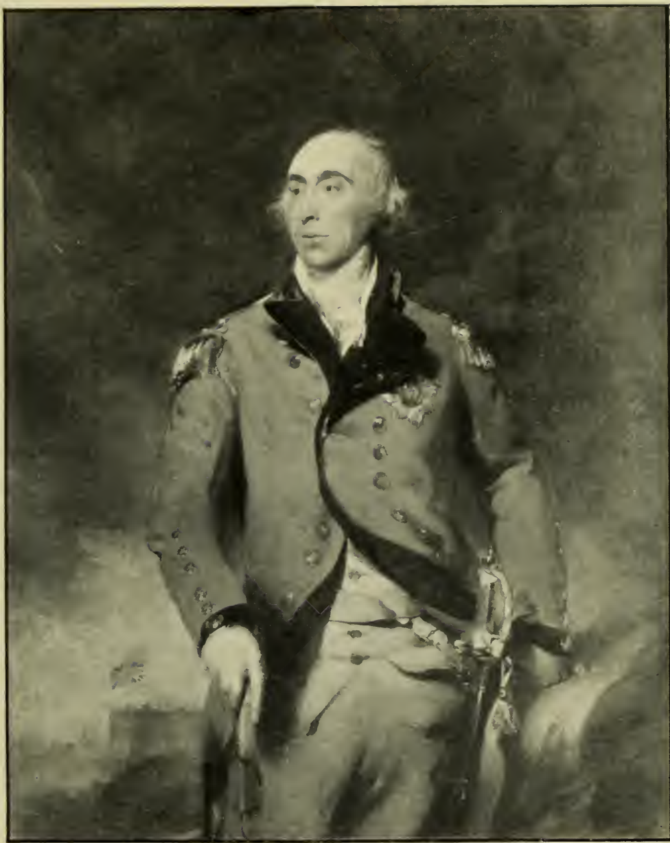
General SIR CHARLES GREY, of Fallodon, afterwards first Earl Grey; 1729-1807; father of the Prime Minister.

From the picture by Sir Thomas Lawrence (1795) at Howick.