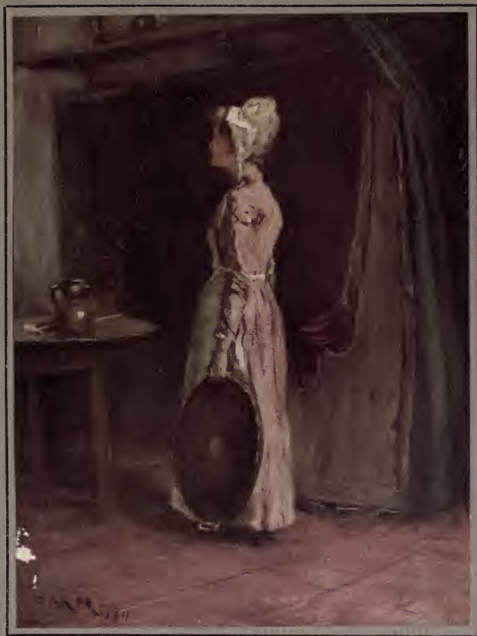
THE WAITING GIRL, JEANIE AMOS