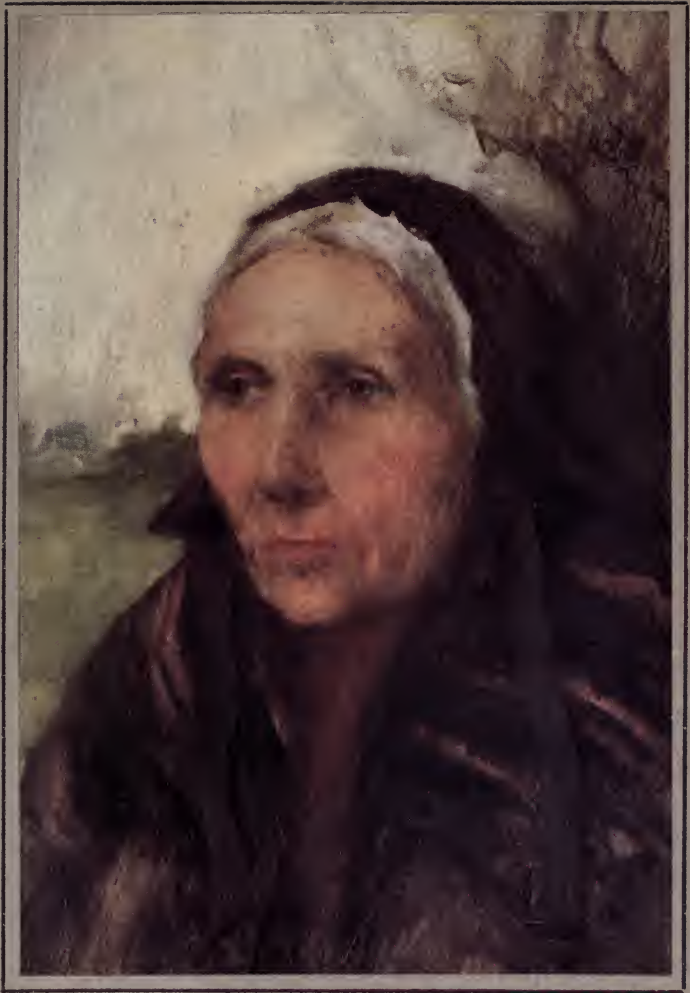
AN OLD DALKEITH BODY