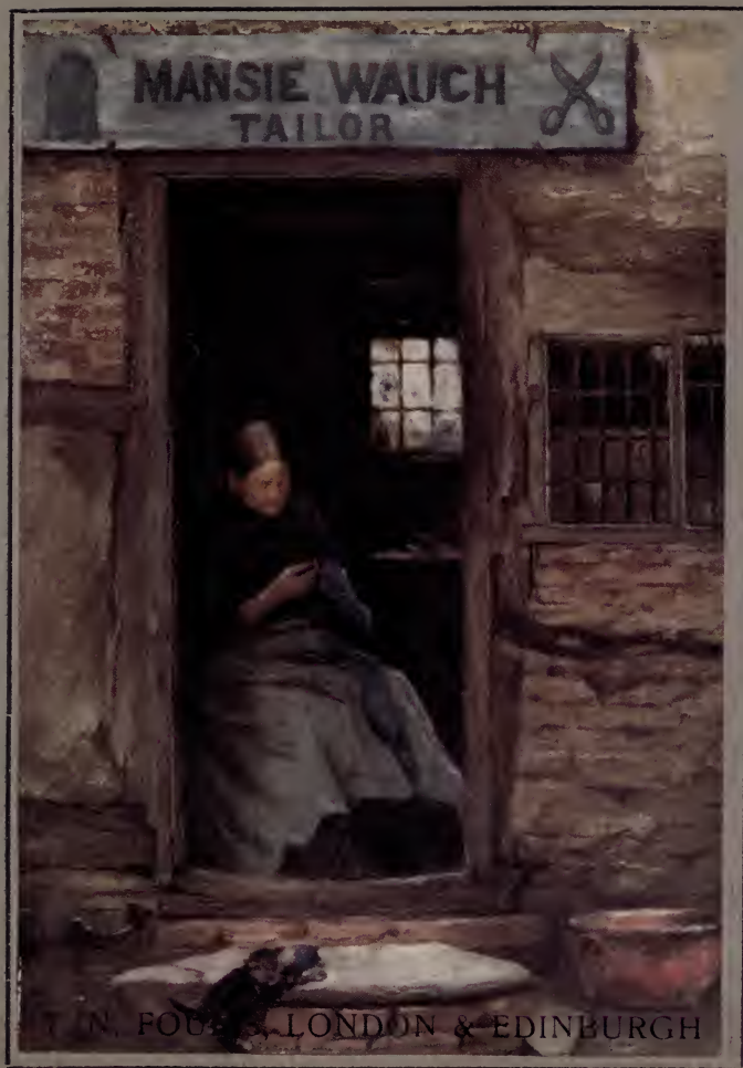
MANSIE'S SHOP DOOR