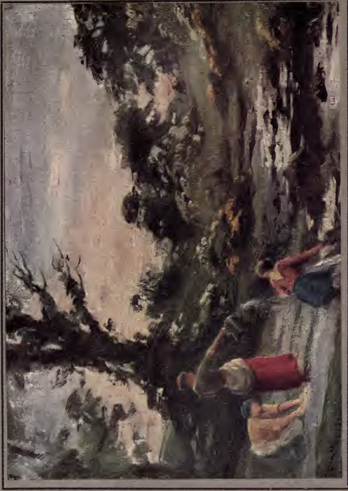
COUNTRY LASSES BLEACHING THEIR SNOW-WHITE LINEN