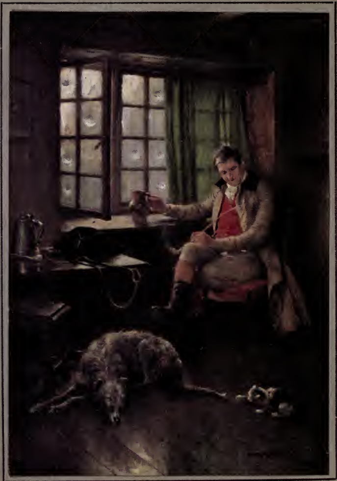
ONE OF THE DUKE'S HUNTSMEN