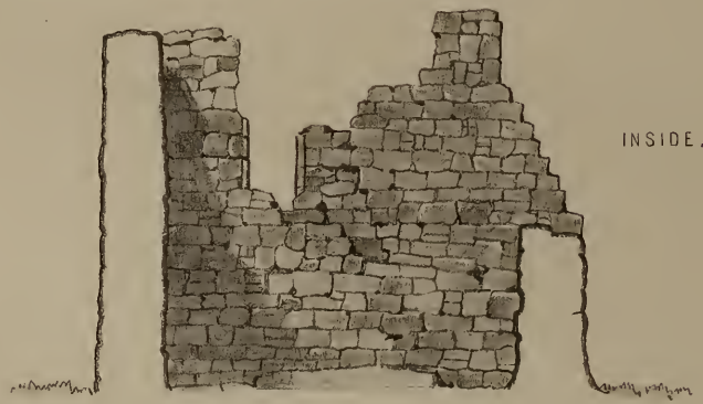
INSIDE. NORTH END.