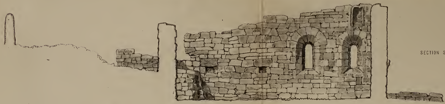
SECTION SHDWING INSIDE OF BACK WALL.