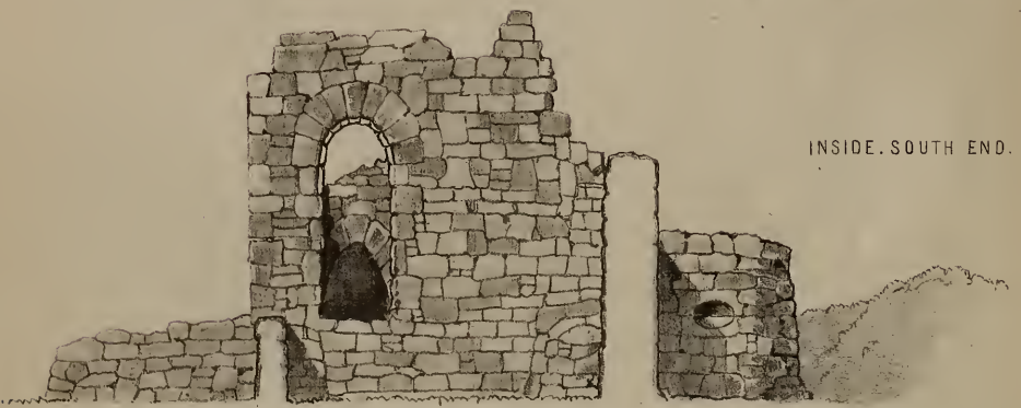
INSIDE. SOUTH END.