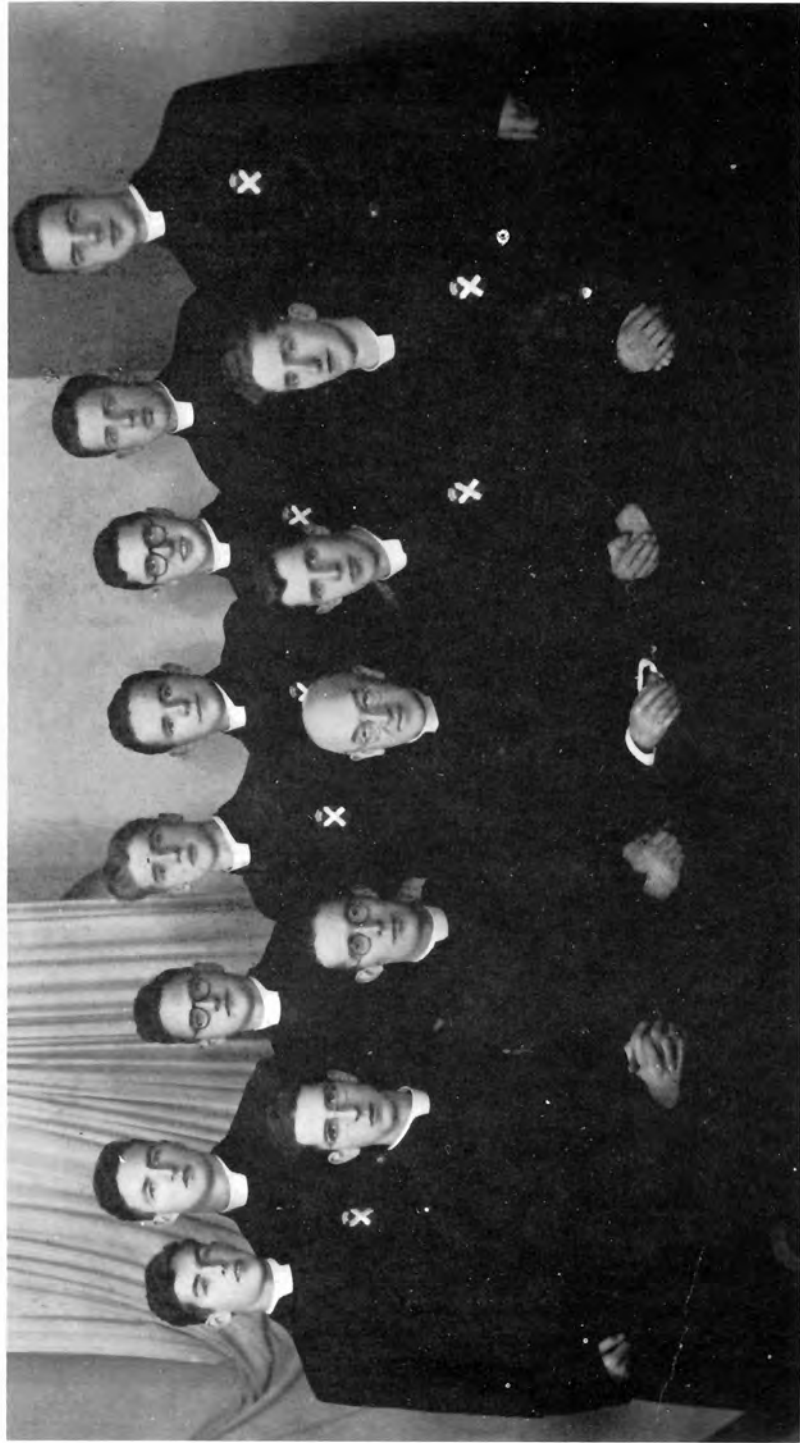
THE COMMUNITY AT THE REOPENING OF THE COLLEGE IN 1950