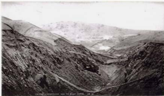
The rent in Rotomahana from the Black Crater photo 138 1886

The expedition continued on. There was a huge crater that looked like a great black hole . This was named the Black Crater because that is exactly what it looked like. The eruption of Mount Tarawera had made a rift about 9 miles long – a huge split in the countryside.