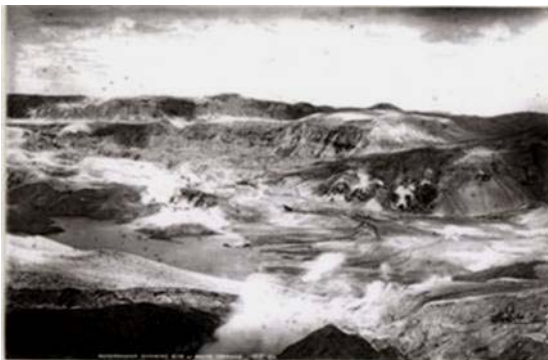
Rotomahana showing site of White Terrace from photo 135 by George Valentine 1886 From Stewart Family Photo Collection

The lake (Rotomahana) had emptied out. An empty lake bed with deep gouges were what was left to be seen then. Where the terraces should have been, they were no longer there. There was just gaping holes and where the Pink Terraces should have been there was a lot of steam.