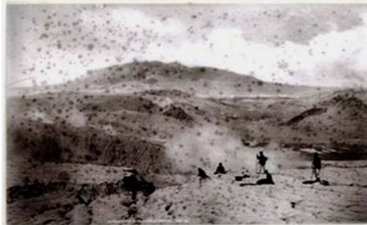
Rotomahana from Hape O Toroa from photo 146 by George Valentine 1886 From Stewart Family Photo Collection

On reaching Te Hape- O- Toroa there was an amazing sight down in the valley below of Rotomahana and the surrounding country. Incredible devastation from the eruption.