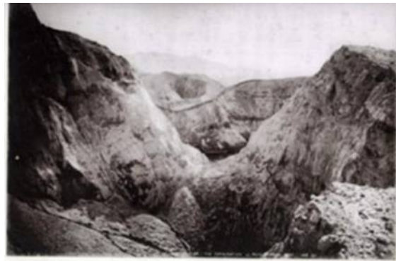
South Crater the termination of Rotomahana Rent from photo 142 by George Valentine 1886 From Stewart Family Photo Collection