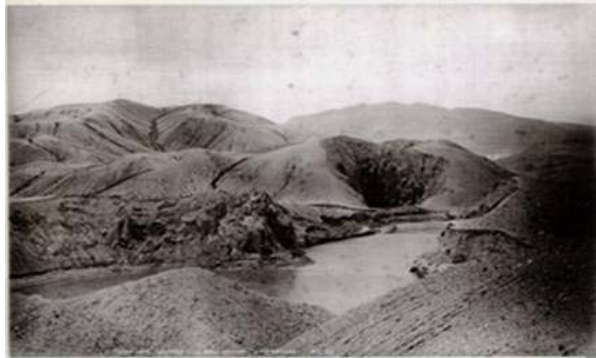
Echo Lake and Hole in the Wall Crater Rotomahana photo 140 1886

The expedition left Wairoa The mountain was still erupting from parts. The incredible natural power of nature in a volcanic eruption – just like Krakatoa. The landscape was like a desert – thick ash and mud everywhere. All was very still. The expedition made its way around the Green Lake (Rotokakahi) and towards Waimangu and Rotomahana. It was hard work walking through the ash and mud. The maori village here had fared a little better from the eruption.