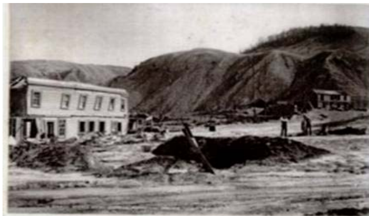
Te Wairoa McCrae's Hotel, Sophia's Whare and Terrace Hotel