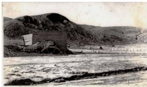
Old Mill Te Wairoa photo 121 by George Valentine 1886 From Stewart Family Photo Collection

Te Wairoa was desolate. The mud was feet thick and almost to the top of the poplar fence posts around the old mill. It was a wonder that anyone survived the eruption.