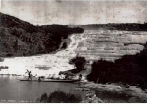
Pink Terrace L Rotomahana