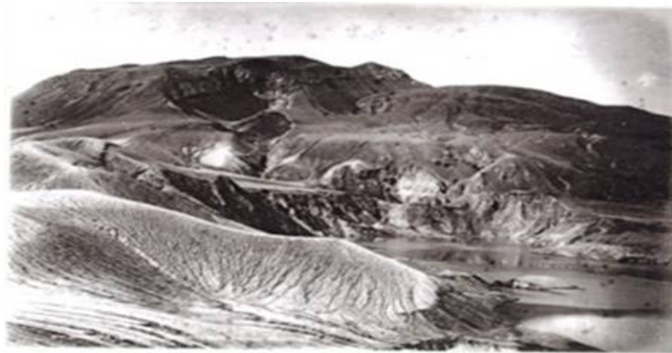
Mt. Tarawera from Maririre showing ash photo 131 by George Valentine 1886 From Stewart Family Photo Collection