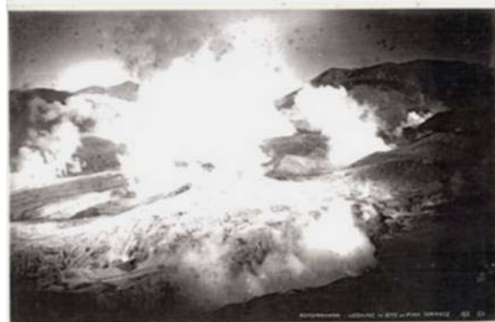
Rotomahana looking to site of Pink Terrace

The beautiful terraces had been completely destroyed and that is a big lesson to all of us – nature gives and nature takes. there is a need to respect the special things of nature and not abuse or take advantage of them as they are not ours to do so.