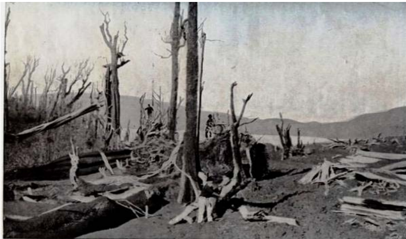
Tikitapu Bush Devastated by the Eruption

The damage was immense. The Tikitapu Bush which was travelled through to reach Te Wairoa was damaged extensively by the force of the eruption. What was beautiful ferns and native trees was stumps and blackened trees which had caught fire.