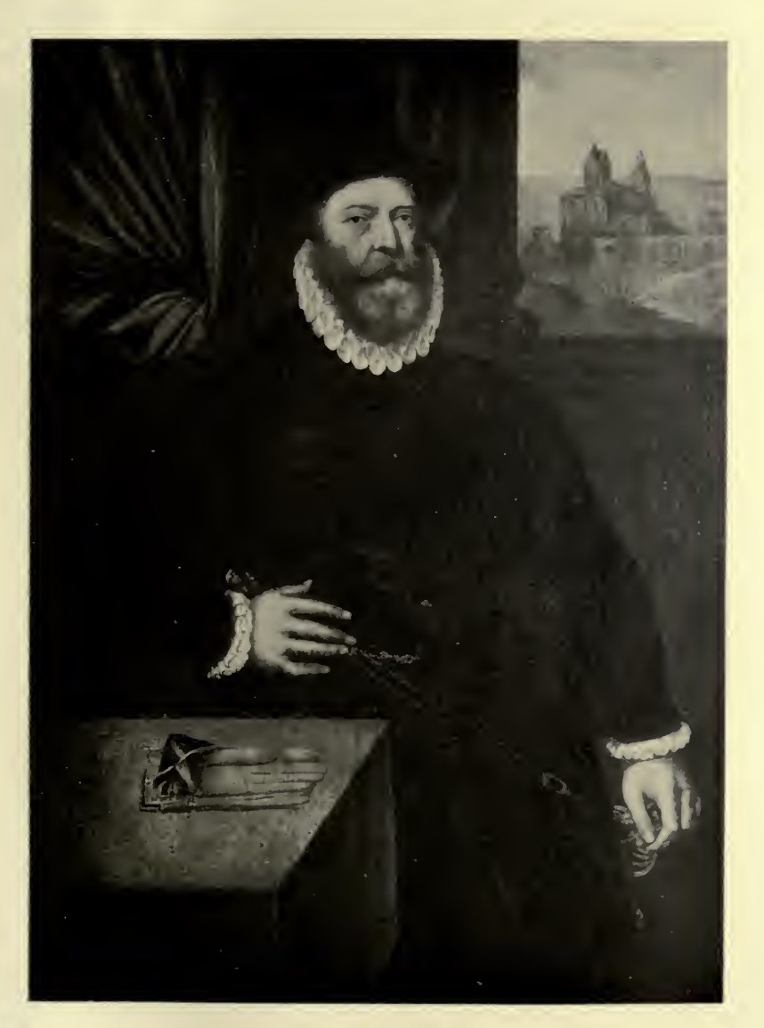
EARL OF MORTON.