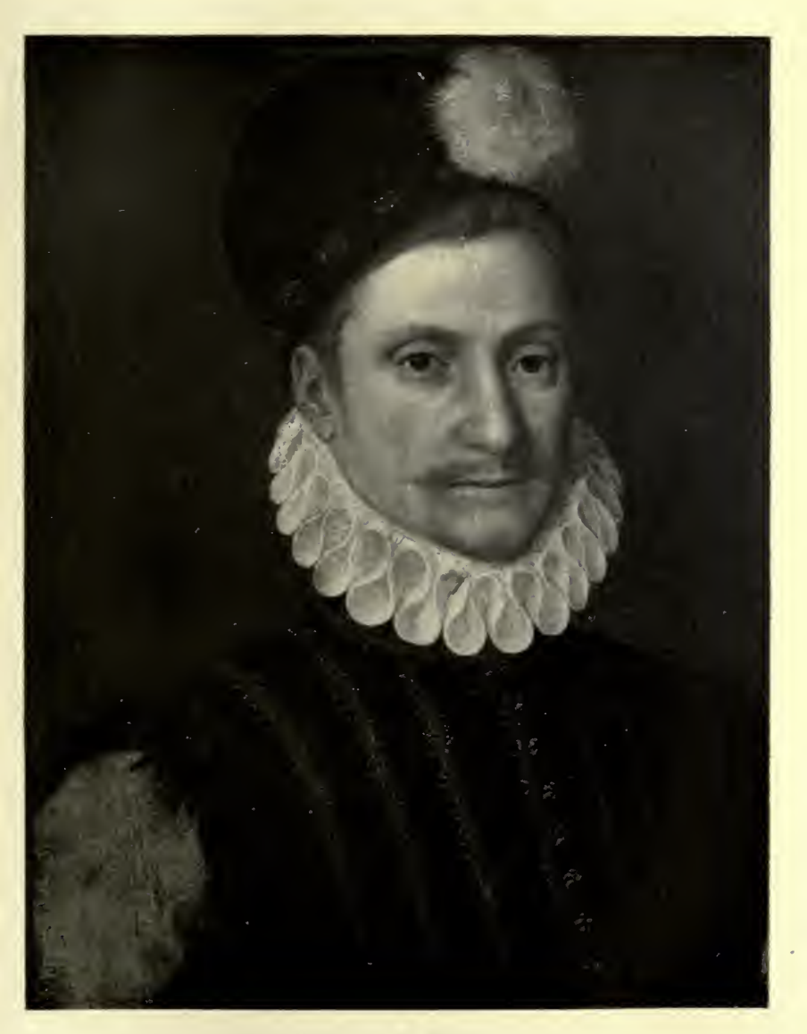
KIRKALDY OF GRANGE. (From a Picture ascribed to Clouet.)