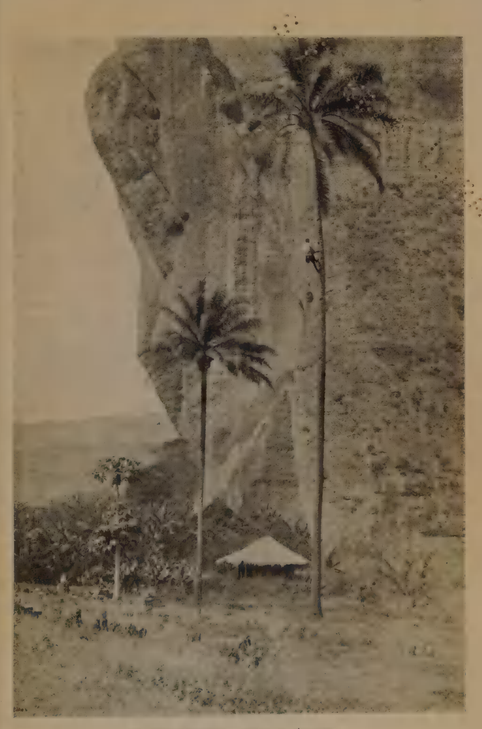
A PICTURESQUE SCENE IN ANGOLA A(native hut is standing beneath the beetling rock; and a man is climbing a palm-tree to cut down nuts.