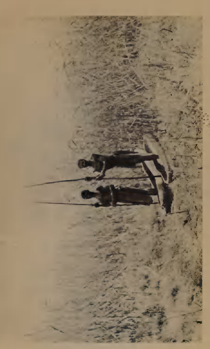
ON THE ZAMBESI Natives pushing their canoes through the reed