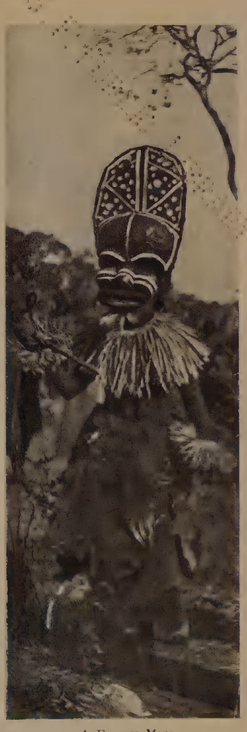
A FETISH MAN In a dress intended to represent a departed spirit.