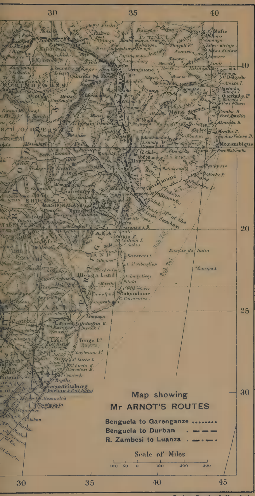
Seeley, Service & Co., Ltd.