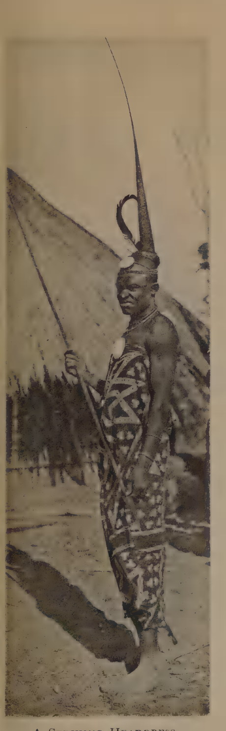
A STRIKING HEADDRESS A Mashukalumpe man. Near the Kafukwe River, upper N.W. Rhodesia.