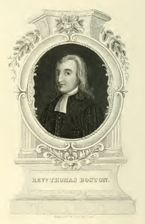
PODER BY WILL AM DIES. BLACGOW