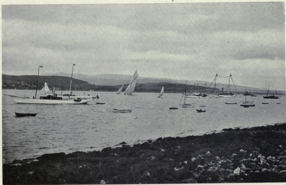
Yachting at Gourock