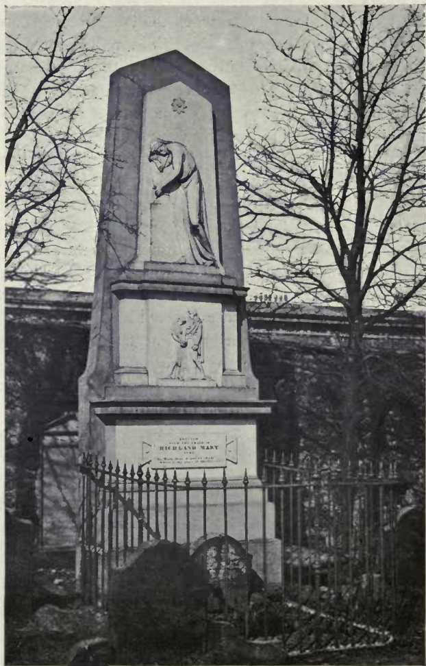
Highland Mary Monument, Greenock