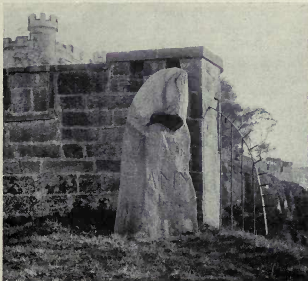
Old Granny Kempoch, Gourock

it has been an object of superstitious reverence. Seamen and fishermen would pace seven times round it singing in order to ensure a prosperous breeze. From "the Goraik" James IV put to sea in 1494 on his expedition to the Western Isles to subdue the Hebridean chiefs. The