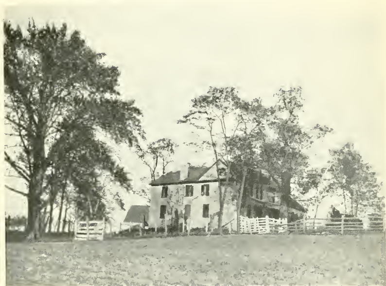
LOCUST HILL, THE CRAIG HOMESTEAD