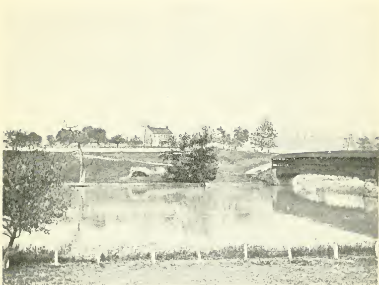
ORR HOMESTEAD, LOUTHER MANOR, AT ORR'S BRIDGE, CUMBERLAND COUNTY, PENNSYLVANIA