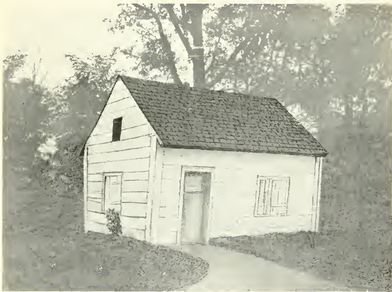
OLD SESSION HOUSE, PASTOR'S STUDY AND ACADEMY, AT DERRY CHURCH, BUILT IN 1732, WHERE THE BOYDS AND CRAIGS OF DERRY ATTENDED SCHOOL