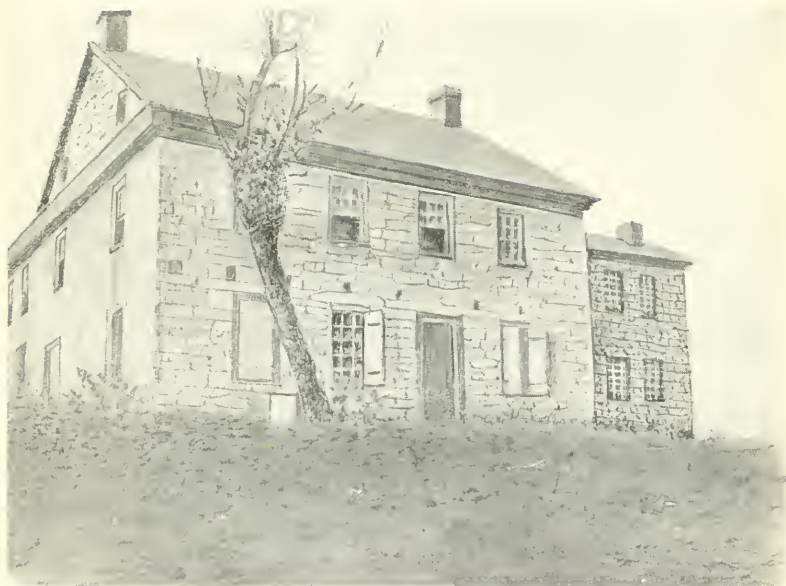
OLD BOYD HOMESTEAD, NEAR DERRY CHURCH, BUILT ABOUT 1760