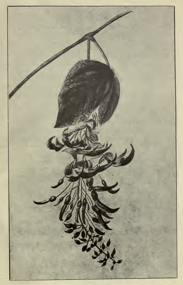
NUKU'IWI "liwi's bill" (Strongylodon lucidum)