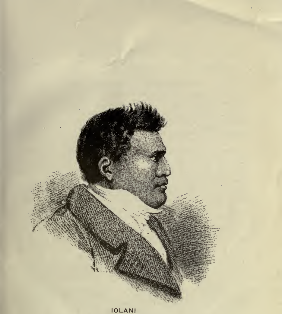
(King Kamehameha II.)