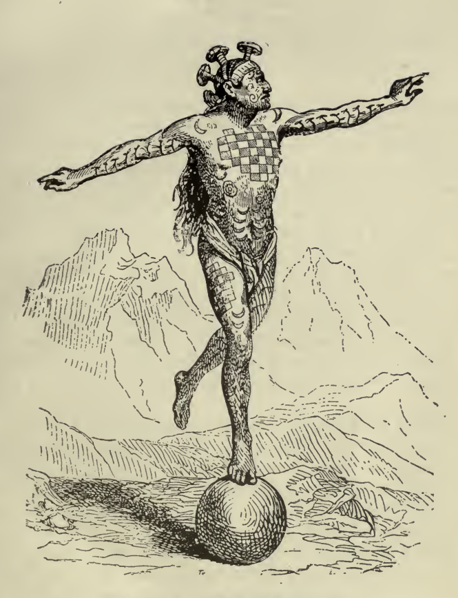
TATOOED HAWAIIAN CHIEF Playing the game of balancing on stone ball