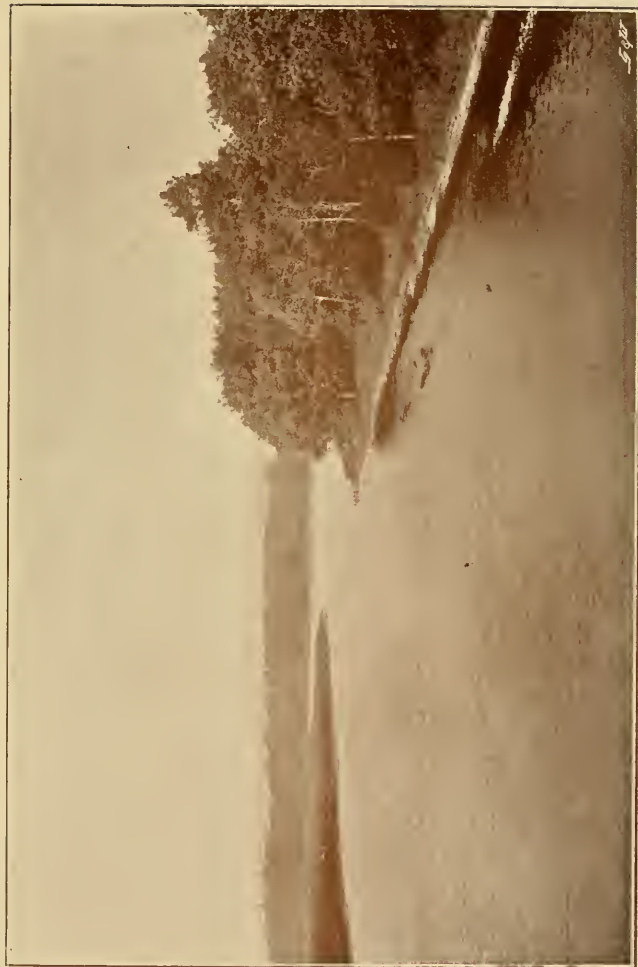
THE DEE BELOW BALMAGHIE KIRK.