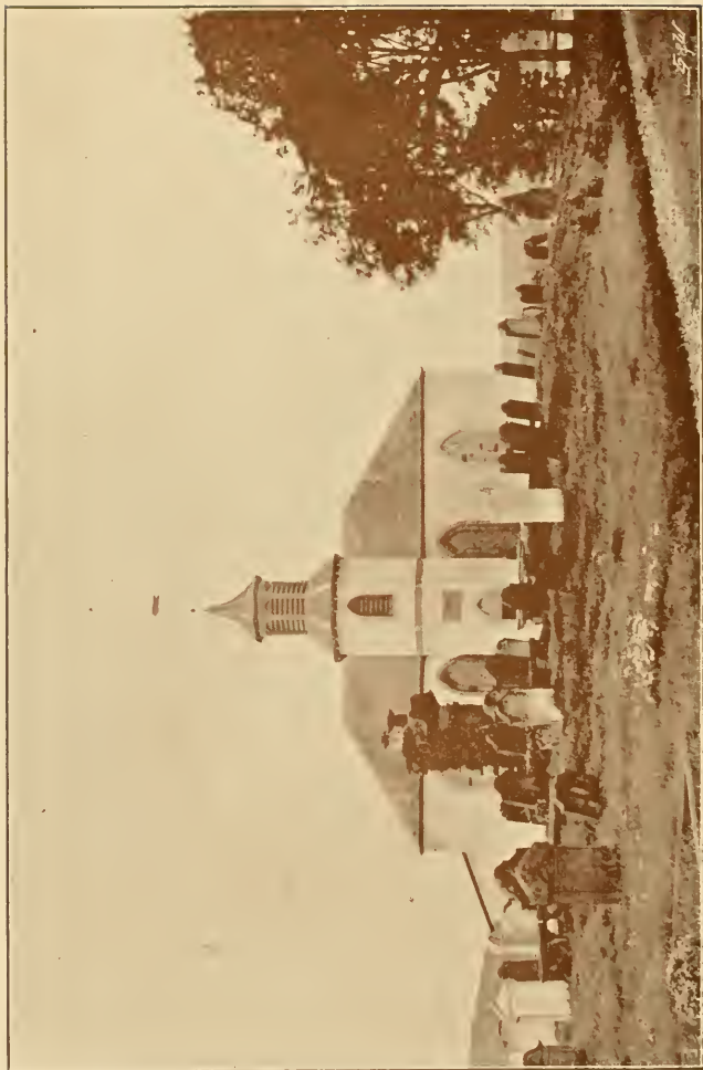
THE "AULD KIRK," BALMAGHIE.