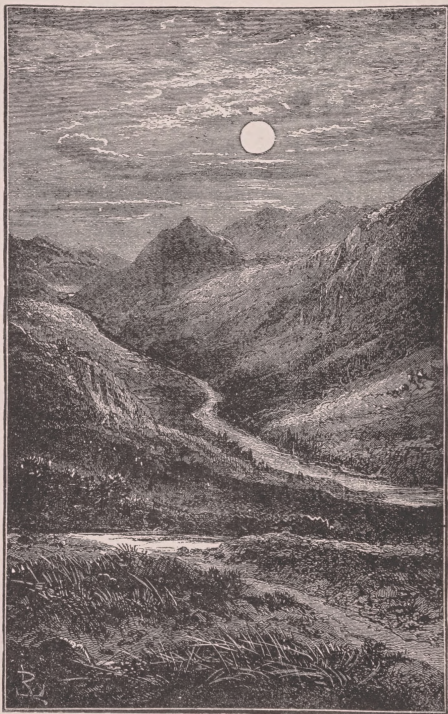
AMONG THE HILLS.