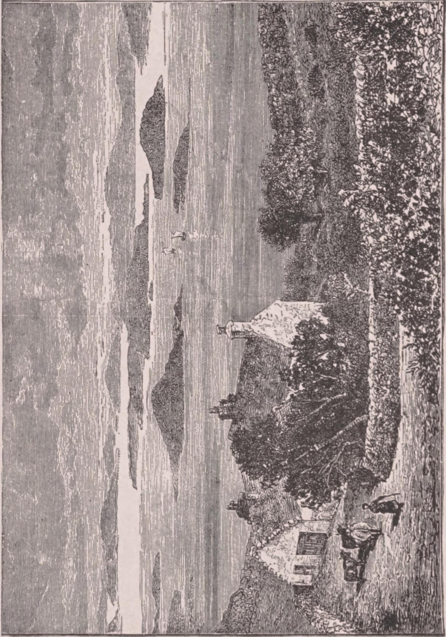
SEA AND SHORE.