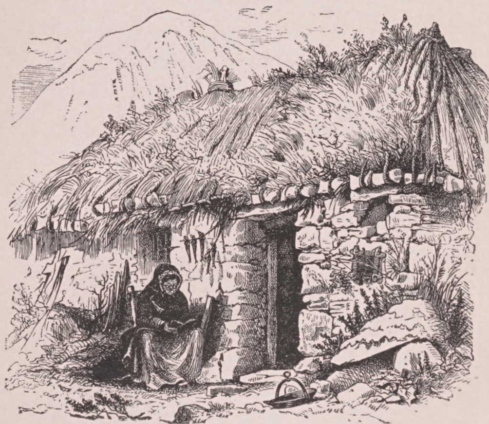
A FISHER'S HUT.