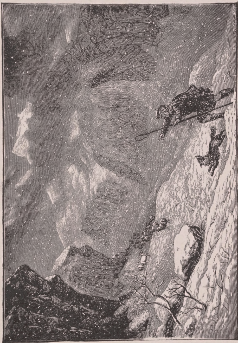
THE HILLS IN WINTER.