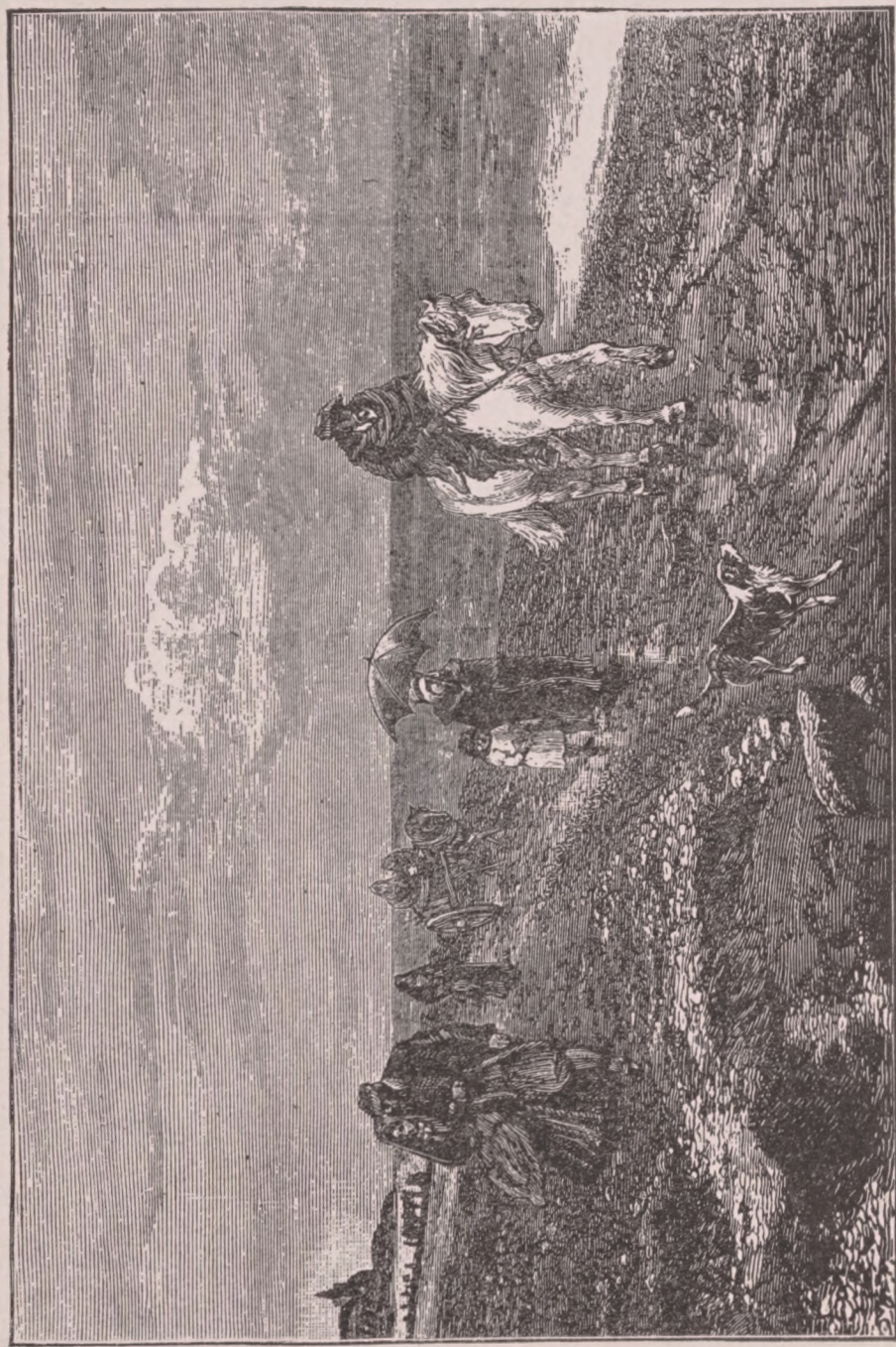
RETURNING FROM WORSHIP.