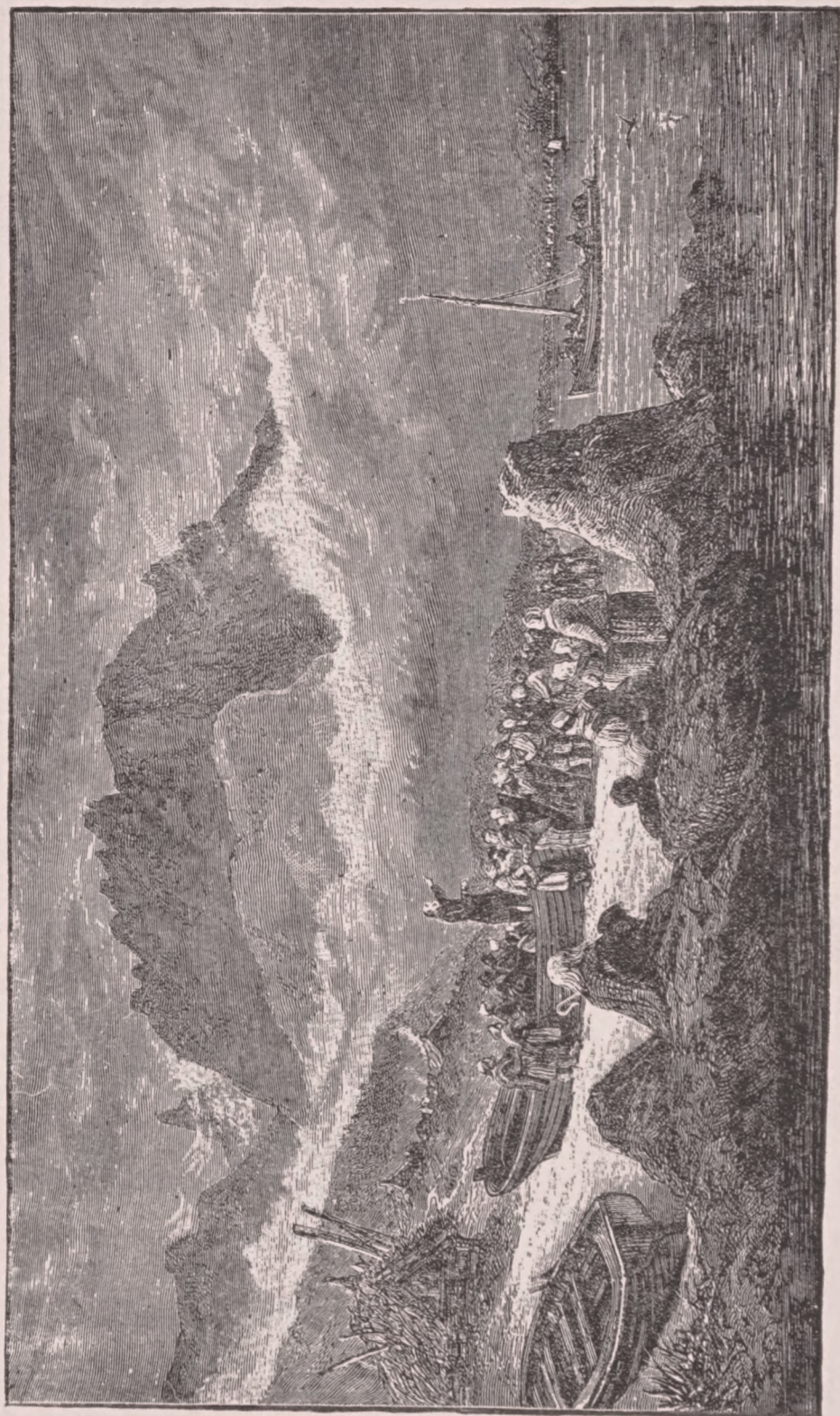
AN OPEN AIR SERVICE.