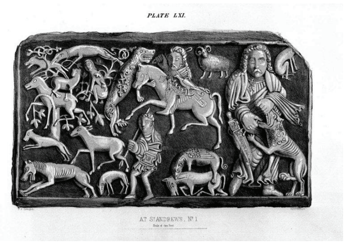
Fig 3: St Andrews Sarcophagus (from Stuart 1856-67, i: pl. LXI)