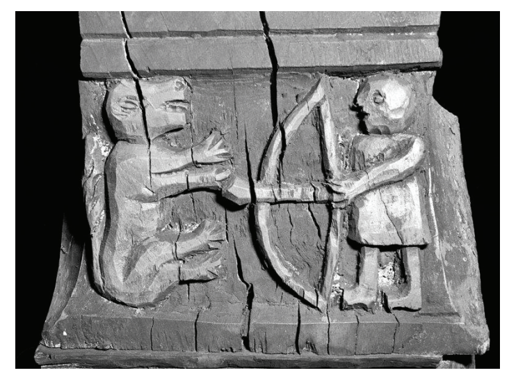
Fig 2: Wolf-slayer in Darnaway Castle