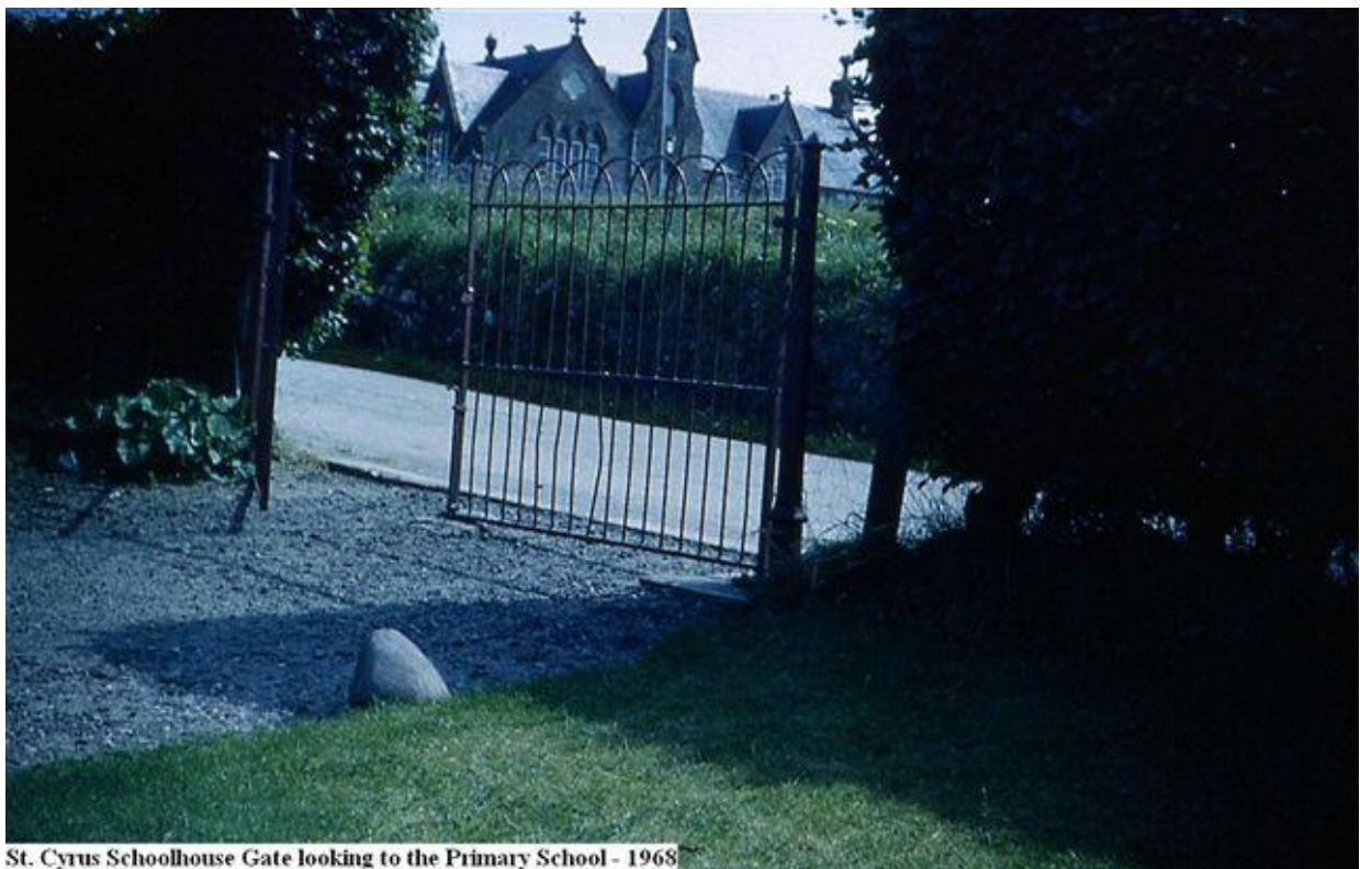
St. Cyrus Schoolhouse Gate looking to the Primary School - 1968