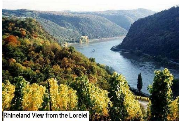
Rhineland View from the Lorelei

We learned that the mighty slate rock Lorelei in the Rhine Valley rises up almost vertically to 145 yards above the water-level. Downstream the river is squeezed into its narrowest and deepest (24 yards) point there and was very difficult to navigate. Even by the 19th century, reefs and rapids still made it extremely dangerous for ships to pass this point. Legend tells that a siren called "Lorelei" would bewitch the hearts of sailors and that when they looked up to the rock, their boats would crash and sink.