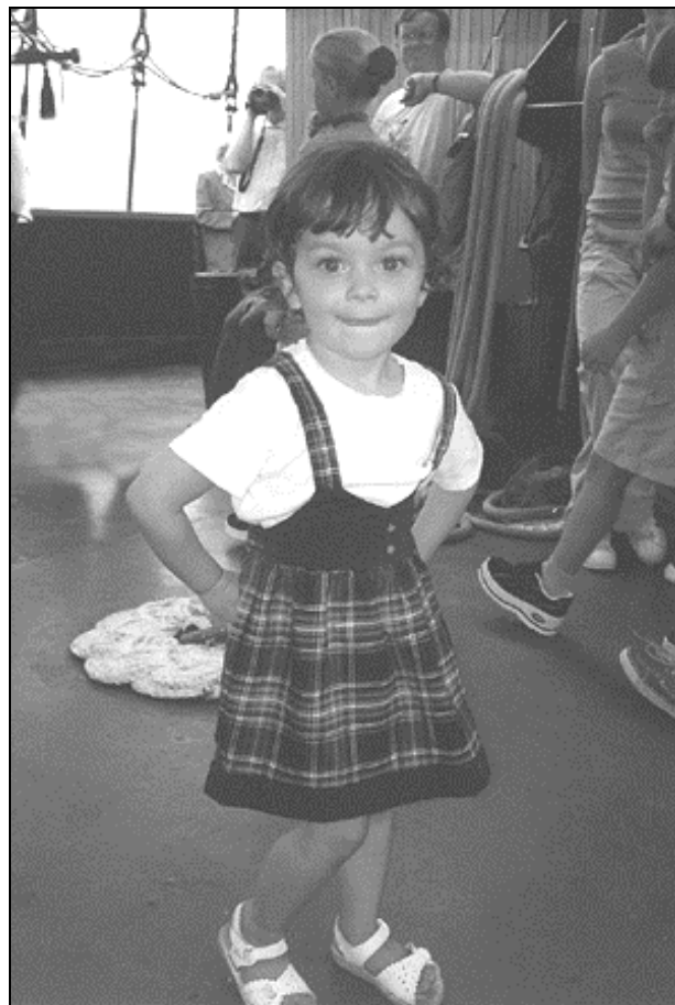
Looking forward to seeing you on board!

For those of you who have been attending this event in the past, please note that the Empire Sandy will be docked at a different location from previous years. It leaves from Pier 6 at Marina Quay West, between Portland St. and Lower Spadina.