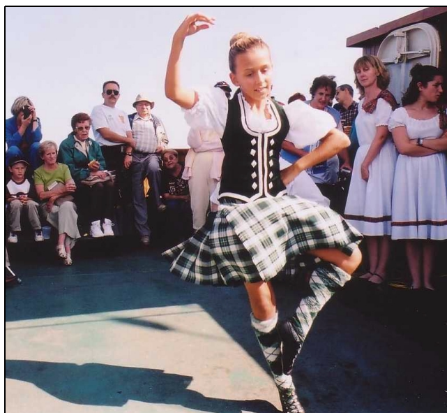
Highland Dancer on board the Empire Sandy on Sept. 2 (More pictures on Page 6)