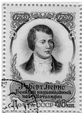
Stamp issued in the former Soviet Union to honour Robert Burns.